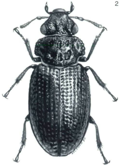
Figs. 1 - 2: Habitus of (1) Ochthebius (s.str.) kosiensis and (2) Protochthebius schillhammeri .

Ventrites I - V (and probably ventrite VI 2 ) pubescent; ventrite VII glabrous. Apical margin of last abdominal tergite of female with a fringe of stiff, short bristles.