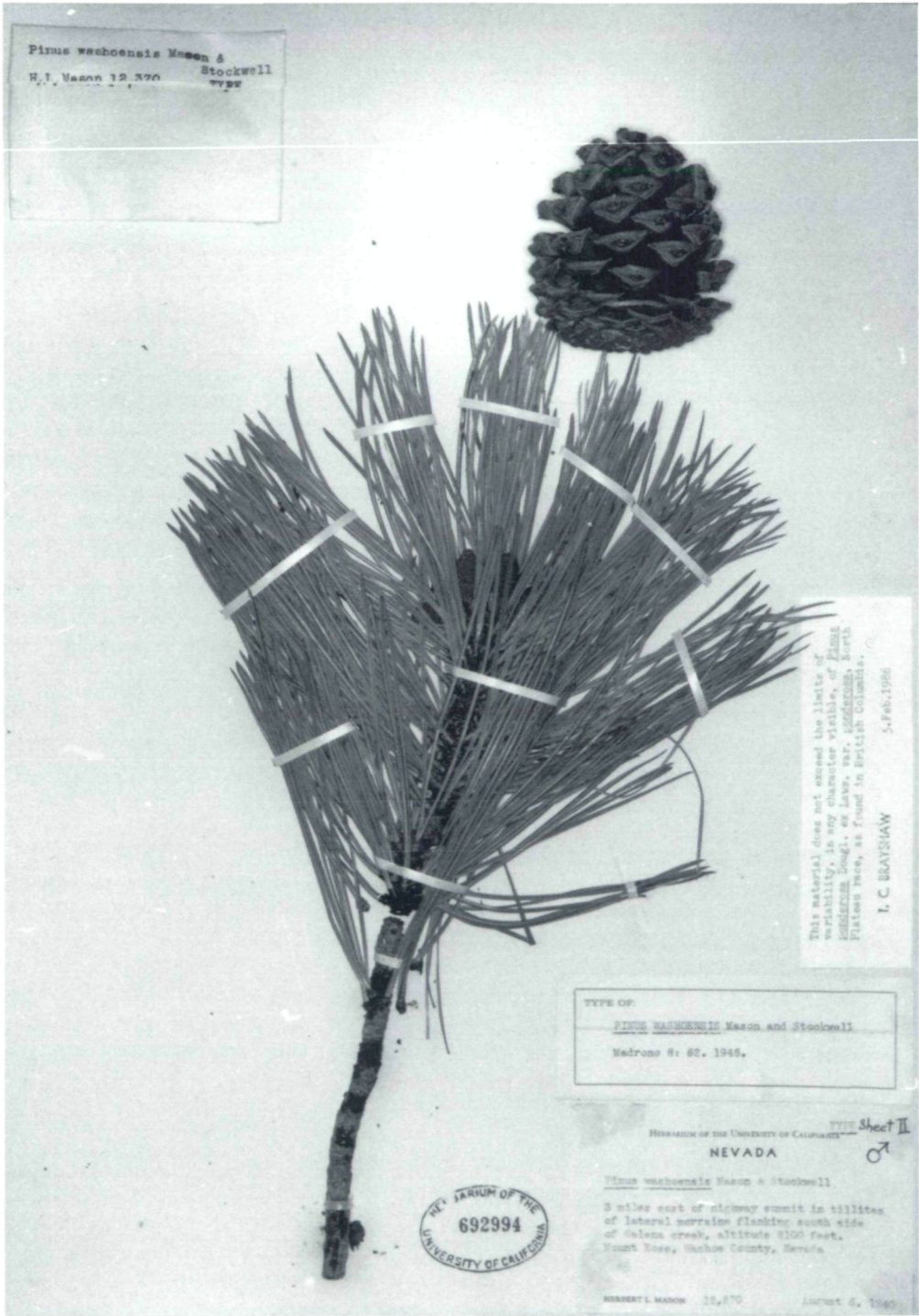
Fig. 2: Isotype of Pinus washoensis H.MASON & STOCKW. [UC], for details see text.