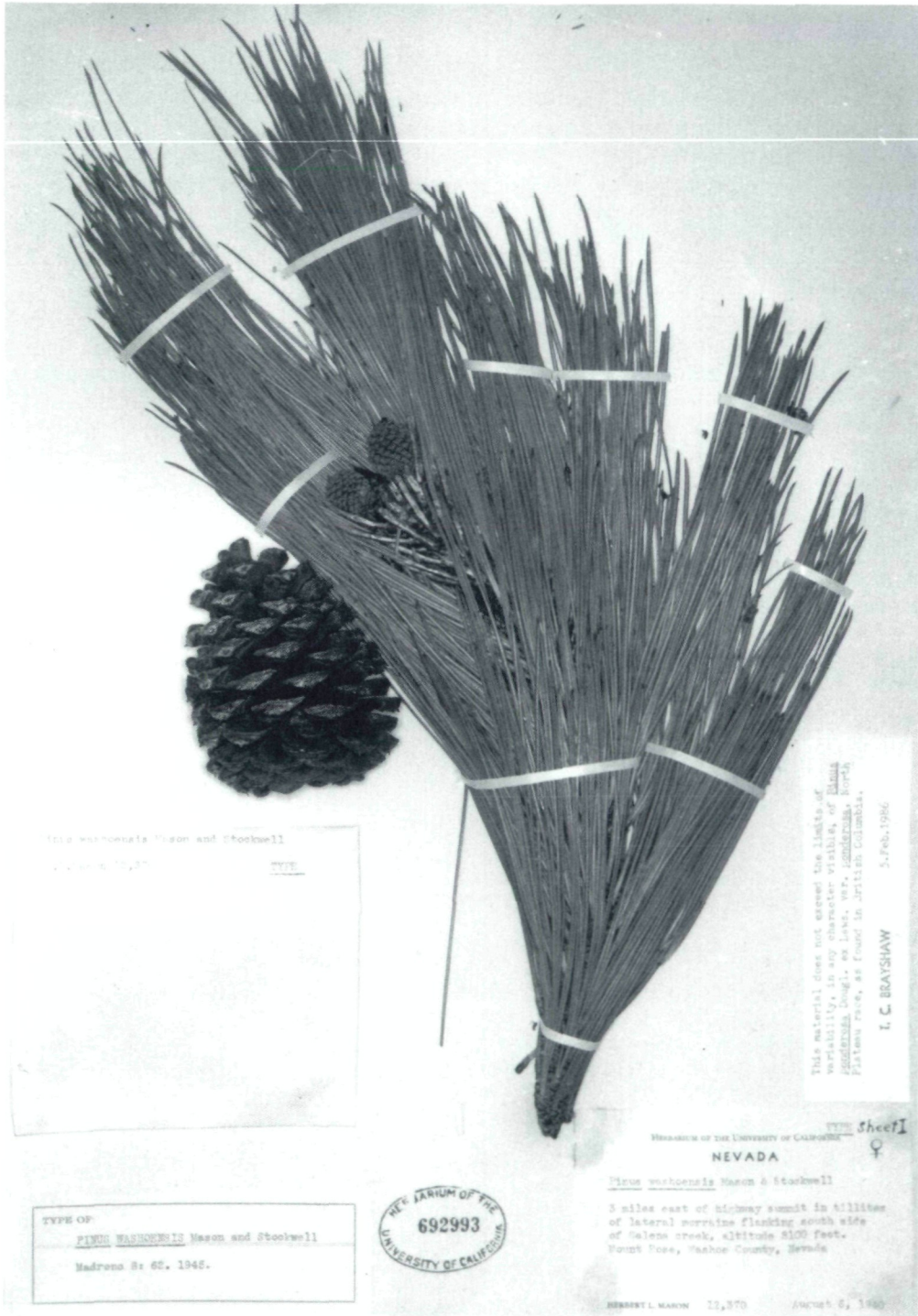
Fig. 1: Lectotype of Pinus washoensis H.MASON & STOCKW. [UC], for details see text.