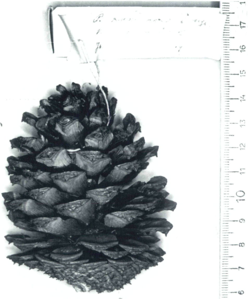
Fig. 4: Cone of Pinus ponderosa DOUGLAS ex C.LAWSON, the neotype [W] (LAURIA 1996): Size 88 x 74 mm.

Rocky Mountain races of ponderosa pine. For example, while immature cone colour for both, P. ponderosa var. scopulorum and P. arizonica , is green, this colour is deep purple not only in Washoe pine, but also in P. ponderosa s.str. (presumably identical with North Plateau ponderosa pine in general). Washoe pine populations on Mount Rose, Nevada (and on other sites in extreme northeastern California), although now recognized to be North Plateau ponderosa pines, would still have to be called relicts, but of a north-western element surviving at the very edge of the Great Basin.