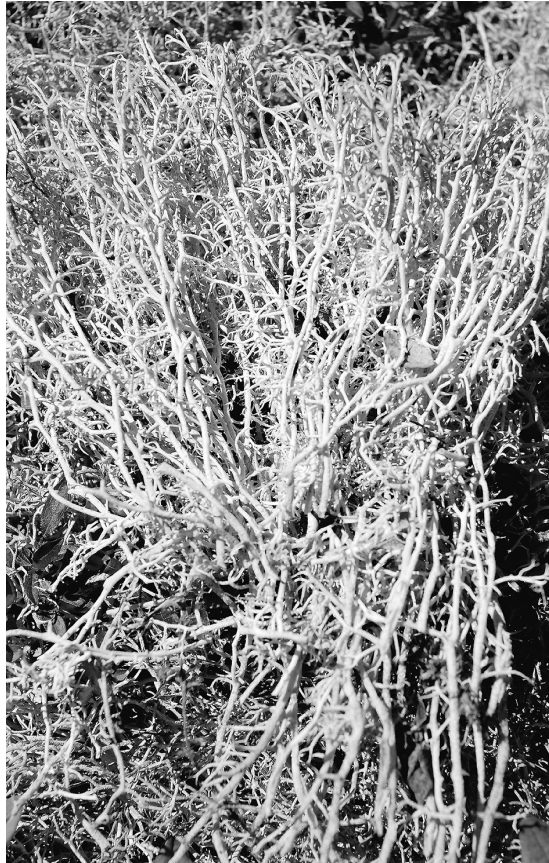
Fig. 1: Cladonia oricola at type locality, Hawke Hills, Avalon Peninsula, Newfoundland. The associated plants Kalmia angustifolia and Sibbaldiopsis tridentata are some of the dominant plants of the maritime heath communities in this area.

Distribution: Cladonia oricola is so far only known from coastal eastern Canada, mostly from the south coast of Newfoundland but also from Nova Scotia and Massachusetts. It is expected to be widespread right on the coast. However, it was observed at least to 200 m on the mountain slopes.