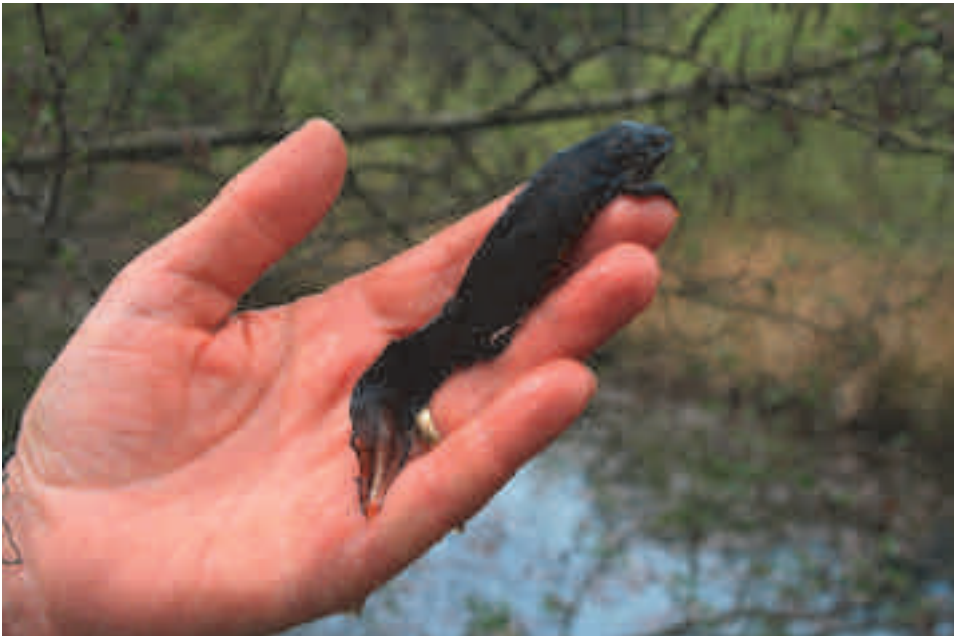
Figure 1: Great crested newt ( Triturus cristatus ) male. Abb. 1: Männchen des Kammmolches ( Triturus cristatus ).

The principle focus for this project was to find an easier, more effective and safer method than bottle traps for surveying for the Great Crested Newt ( Triturus cristatus ) which is particularly protected in the United Kingdom (fig. 1).