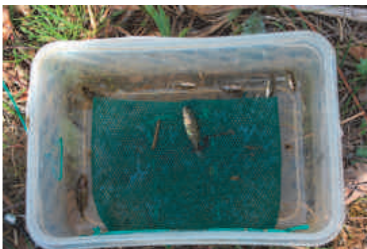
Figure 8: By-catch, in this case sticklebacks ( Gasterosteus aculeatus ), Photo: D. Dewsbury.

Other interesting facts have emerged such as the sex ratio of captured newts which was found to be approximately 75% male and 25% female for all species.