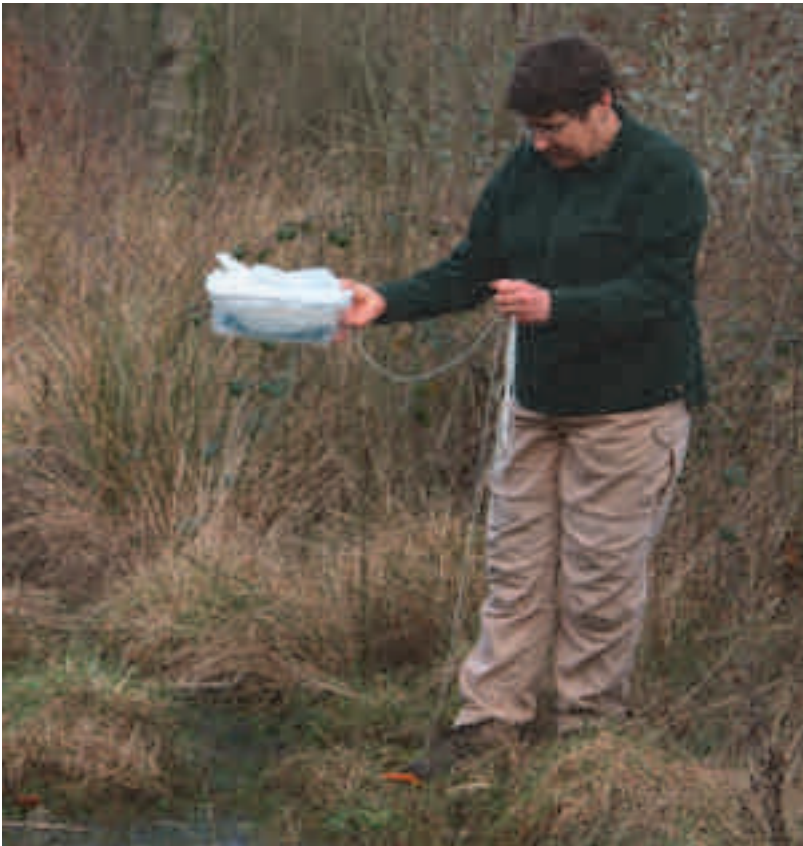
Figure 4a: Newt trap ready to launch (Photo D. Dewsbury).

Transfer the trap to the RH but with the coiled cord still in the LH (fig. 4a.)