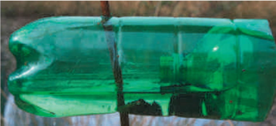
Figure 7: Conventional bottle trap. Abb. 7: Übliche Flaschenfalle.

A very small comparison trial was conducted in 2010 to make a direct comparison between the prototypes of the new trap and conventional bottle traps (fig 7.)