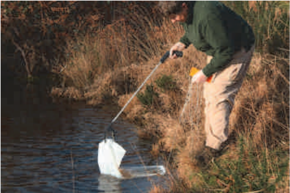
Figure 5a and b: Retrieval of the Newt trap. Abb. 5a und b: Einholen der Molchfalle.