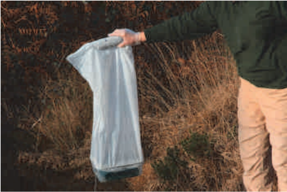
Figure 5c: Newt trap retrieved with newts inside (Photo: D. Dewsbury). Abb. 5c: Eingeholte Molchfalle mit gefangenen Molchen.