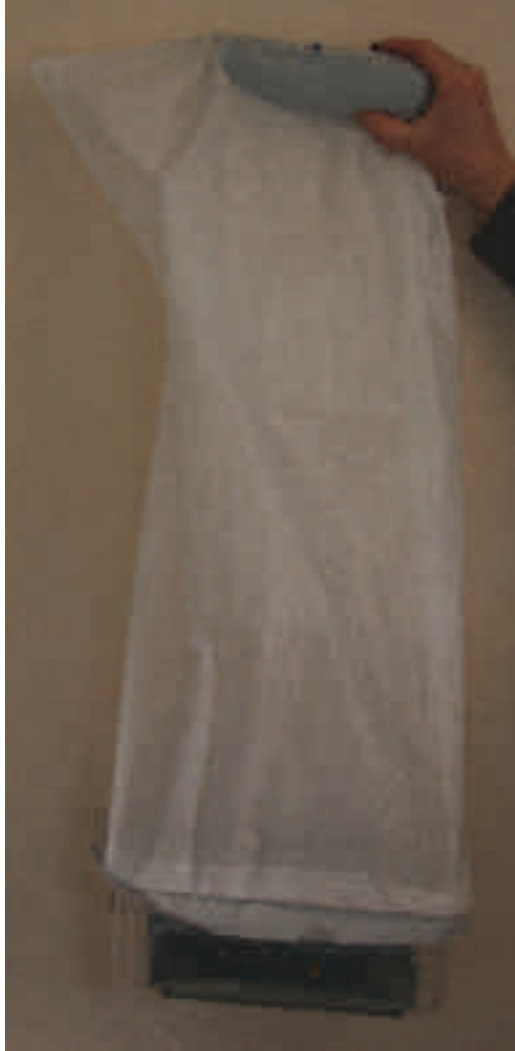
Figure 3d: Newt trap assembled. Abb. 3d: Zusammengebaute Molchfalle.