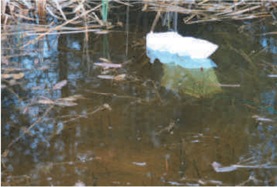
Figure 4b: Newt trap deployed.

3. Toss the trap assembly out to the desired spot, trying to make it land upright. (Not essential) Allow for 'wind drift' during sinking if necessary. Wait for the box to sink fully (fig. 4b), wind in all slack line and secure the winder in the bank-side vegetation. Submerge the line as much as possible to keep human attention to a minimum. Check as far as possible that the box is not floating off the bottom.