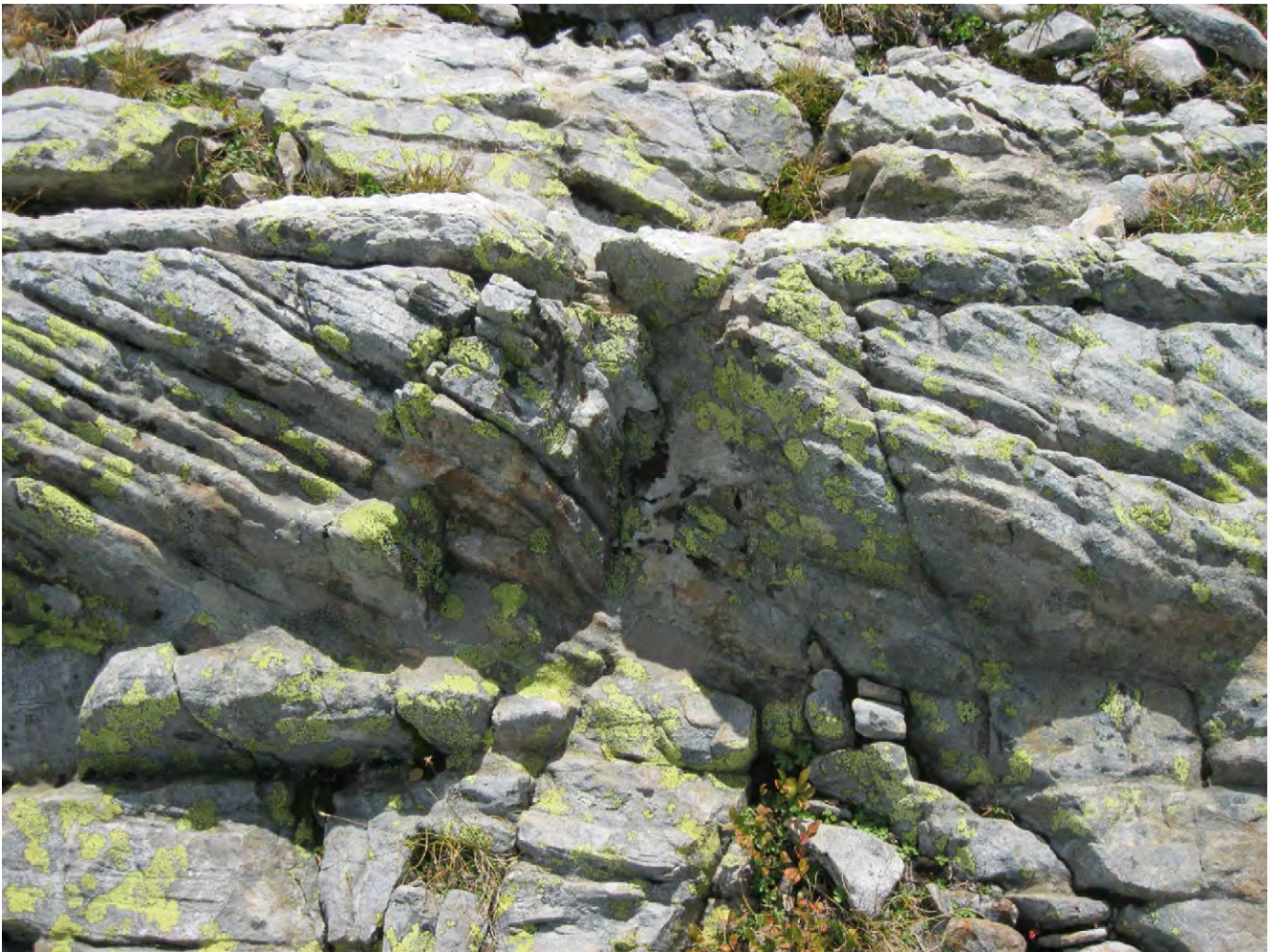
Cross-bedded siliciclastics (sandstones) of the Himmelberg Formation on upper Rauchkofelboden along the trail (2150 m) from Lake Wolayer Hut to Mt. Rauchkofel.