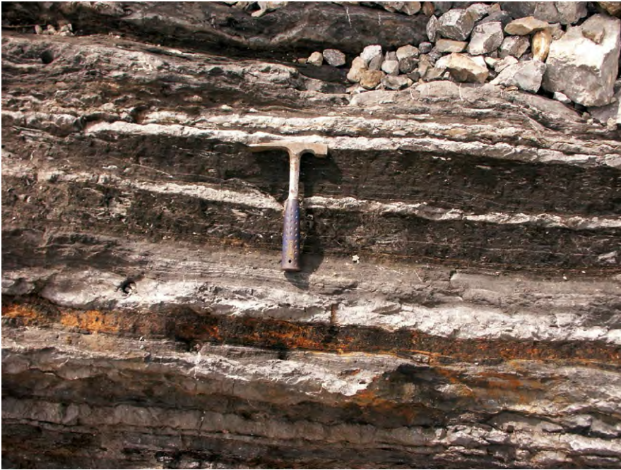
Detail of the planar laminated fine-grained calcareous levels of the Cardiola Formation exposed in the Cellon Section.

Cardiola-Schichten: GEYER (1894). Bunte Flaser- oder Bänderkalke und Kalkphyllite des Obersilur [partim]: GEYER (1899). Cardiolaniveau: GAERTNER (1931). Cardiola Beds: SCHÖNLAUB (1970). Cardiola Beds: SCHÖNLAUB (1980). Calcarei a Cardiola : VAI et al. (2002). Livello a Cardiola : CARULLI (2006).