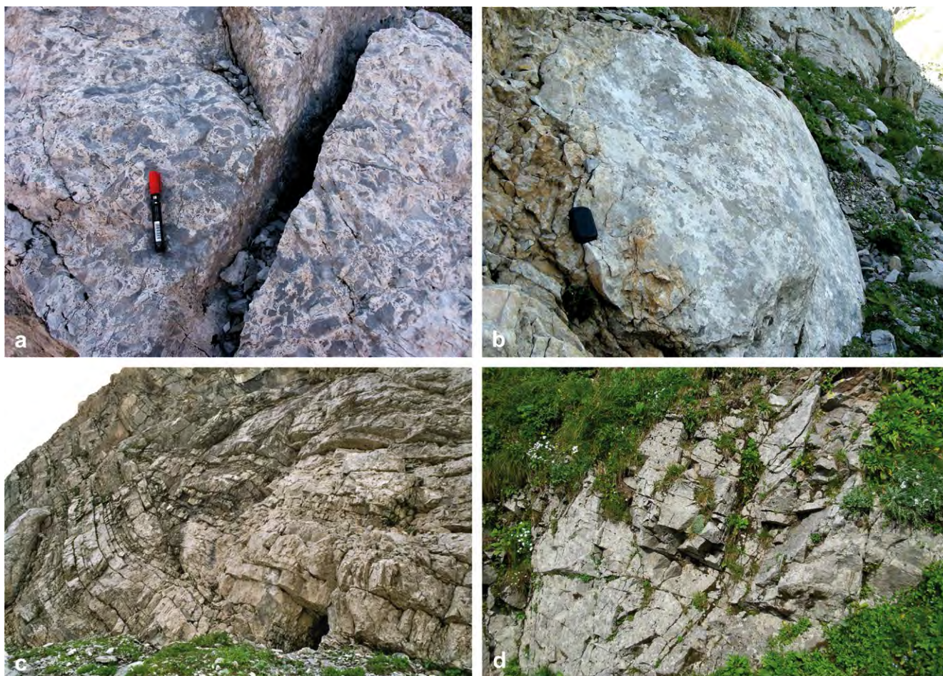
View of the Seekopf Formation (type section) in the field. a) lithoclastic layers (photo H.P. SCHÖNLAUB); b) the megaclast horizon with boulders of up to 9 meters (photo T.J. SUTTNER); c) well-bedded, dark gray crinoidal limestones showing a thickening upward cyclicity (photo T.J. SUTTNER); d) view on equivalent beds from the base of the formation at the RLF III section (photo C. CORRADINI).

Isotope Geochemistry . – SUTTNER (2007); CORRADINI & CORRIGA (2010).