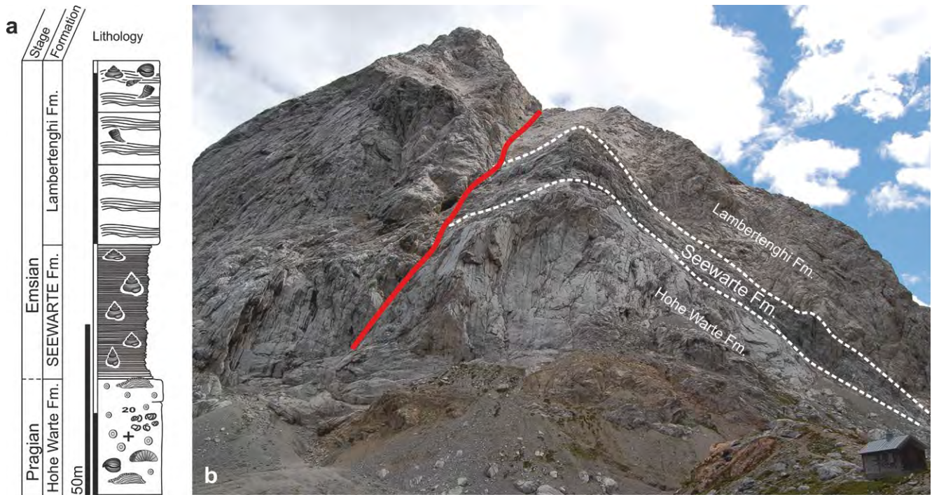
The Seewarte Section. a) simplified log of the Seewarte Formation; b) view of Mt. Seewarte with the dark band of the Seewarte Formation (dashed white line) above the Hohe Warte Formation and below the Lambertenghi Formation. The red line depicts a fault. The continuation of the Seewarte limestone towards the peak of the mountain is not visible in this image.