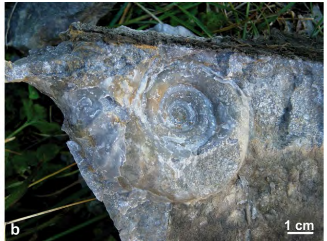
Views of the Seewarte Formation in the field. a) large gastropods are characteristic of the Seewarte Formation; b) euomphalid gastropod from near the top of the unit.