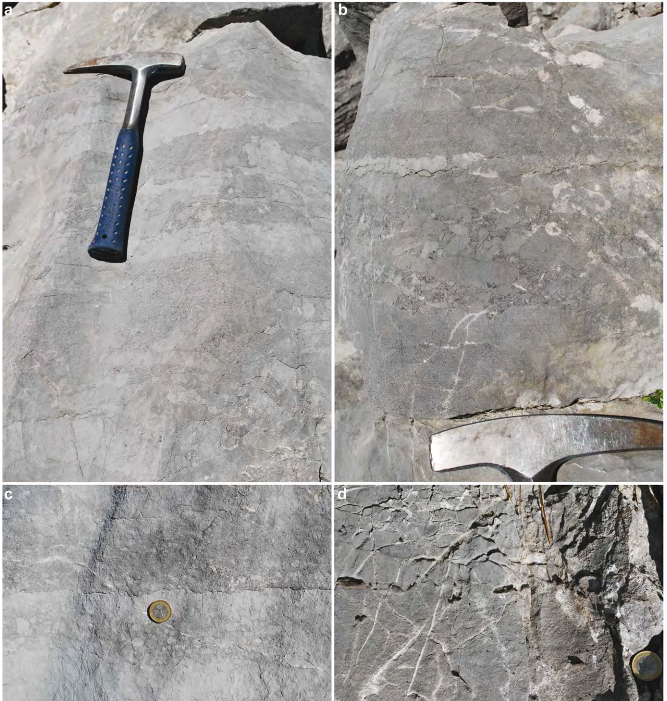
Views of the Cellon Formation in the field. a) part of a rudstone bed: Freikofel Section; b) part of a rudstone bed: Freikofel Section; c) erosional surface within a bed: Freikofel Section; d) phosphorite nodules: Freikofel Section.

About 55 m (Freikofel) to about 85 m (Kellerwand).