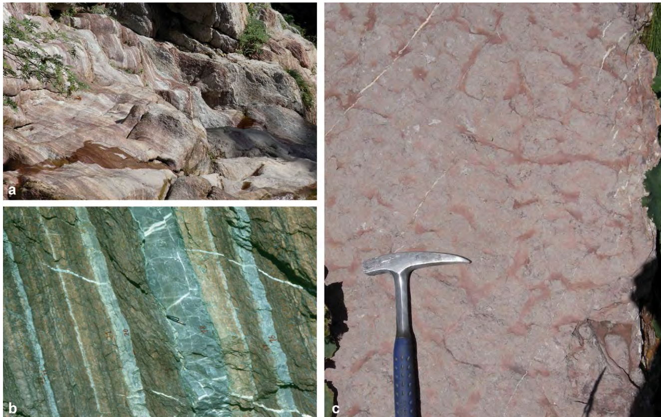
Views of the Findenig Formation in the field. a) view of the outcrop along the Rio Chiarsò; b) allodapic layers (gray) at the Stua Ramaz Section; c) the typical nodular limestone of the Findenig Formation on a bed surface in the Costone Lambertenghi/Seekopf Sockel Section.