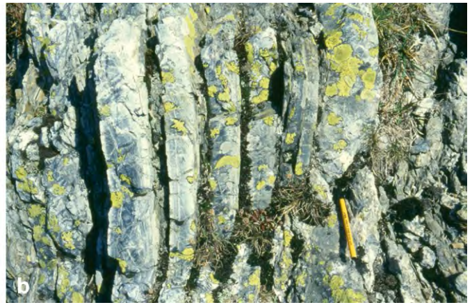
Views of the Zollner Formation in the field. a) radiolarian chert with limestone lenses at Rio Chianaletta; b) radiolarian chert in the Pramasio Pass area.