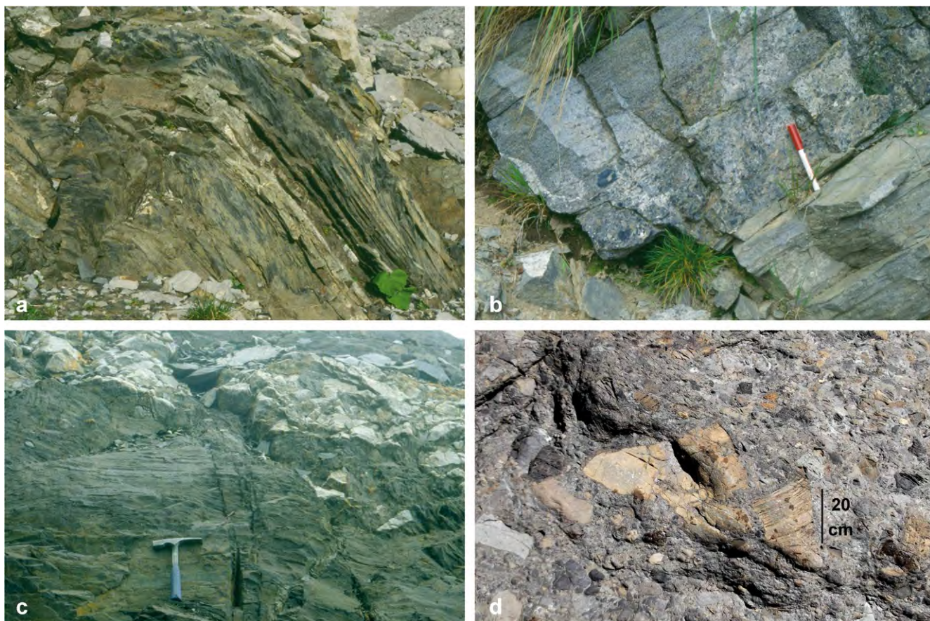
Views of the Hochwipfel Formation in the field. a) sandstones, siltstones and shales of lithofacies a, outcrop along the Valentin Valley (photo C. VENTURINI); b) silicatic breccia of lithofacies b, near Casera Plotta (photo C. SPALLETTA); c) limestone rudite of lithofacies c, near Creta di Collina (photo C. SPALLETTA); d) silicatic breccia of lithofacies b, near Casera Plotta (photo F. SGORBINO).

Hochwipfel-Formation/Hochwipfel Formation: SUTTNER (2014).