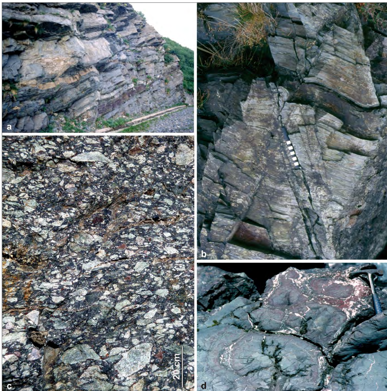
Views of the Dimon Formation in the field. a) volcanic turbidites of lithofacies a, Mt. Dimon (photo C. VENTURINI); b) green slates of lithofacies b, Mt. Tenchia (photo C. SPALLETTA); c) volcanic breccia of lithofacies c (photo C. SPALLETTA); d) pillow lavas of lithofacies c, Rio Chiaula (photo F. SGORBINO).