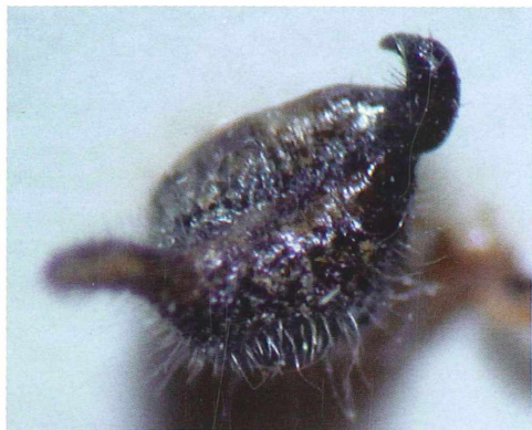
Fig. 4: Cercus of a male of the population from Ljubljansko Barje.