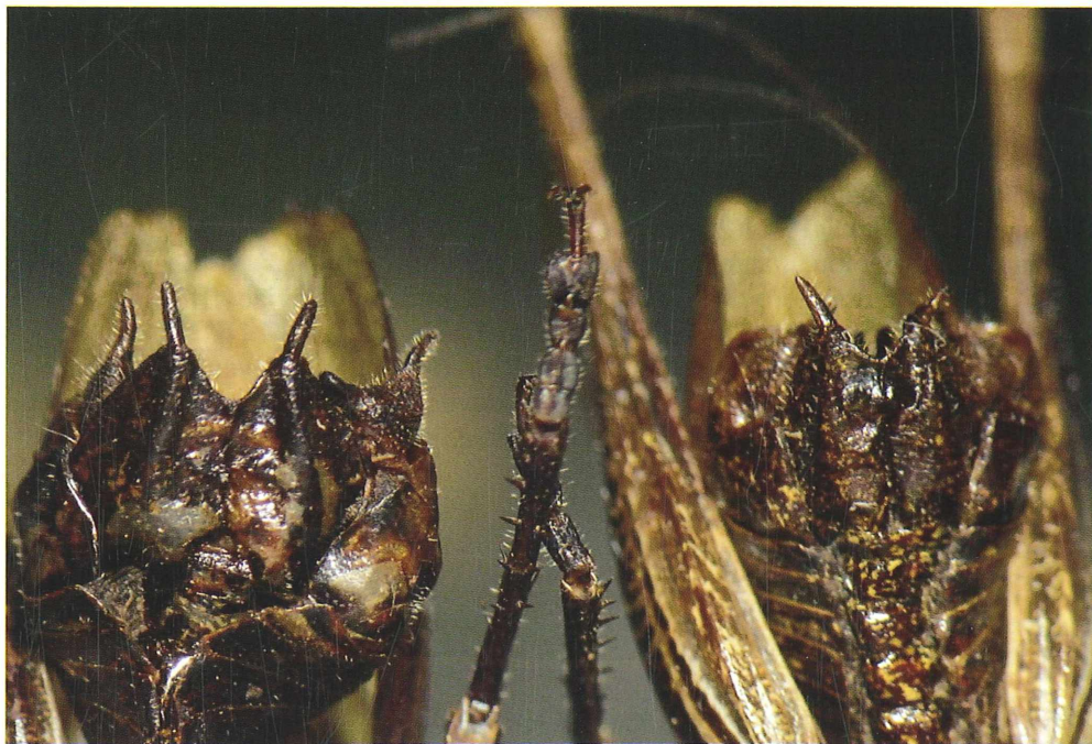
Fig. 7: Shape of subgenital plate of specimens from Ljubljansko Barje. Left subgenital plate of 4 »typical specimens«, right subgenital plate of atypical specimen from the same location.

Sl. 7: Oblika subgenitalne plošče pri primerkih z Ljubljanskega barja. Levo subgenitalna plošča pri 4 »običajnih primerkih«, desno subgenitalna plošča pri netipičnem primerku z iste lokacije.