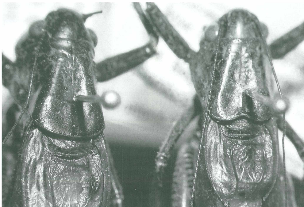
Fig. 6: Shape of pronotum and stridulatory organ of specimens from Ljubljansko Barje. Left pronotum of 4 »typical specimens«, right form of pronotum of atypical specimen from the same location.

Sl. 6: Oblika pronotuma in cvrčalnega aparata pri primerkih z Ljubljanskega barja. Levo pronotum pri 4 »običajnih primerkih«, desno oblika pronotuma pri netipičnem primerku z iste lokacije.