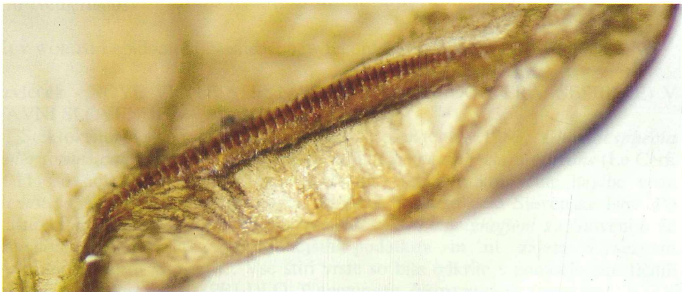
Fig. 8: Stridulatory file of a specimen from Ljubljansko Barje.

Sl. 7: Oblika subgenitalne plošče pri primerkih z Ljubljanskega barja. Levo subgenitalna plošča pri 4 »običajnih primerkih«, desno subgenitalna plošča pri netipičnem primerku z iste lokacije.