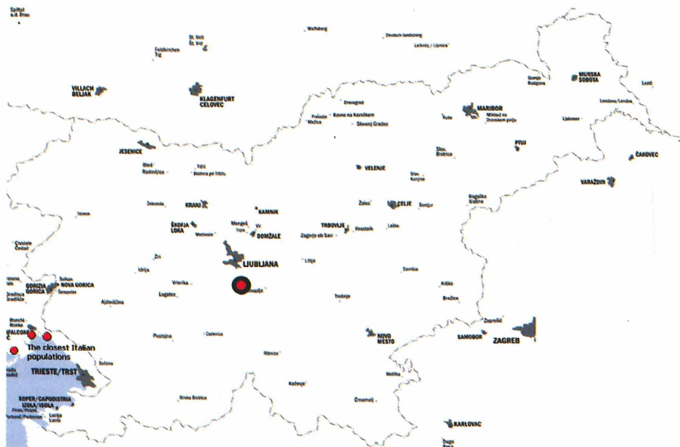
Fig. 1: Map of Slovenia with the new finding site of Z. marmorata . The closest Italian sites are also marked.

The site with Z. marmorata is located in the vicinity of Ljubljana, about 1 km east from the village Ig, along river Iščica on Ljubljansko Barje, at 290 m above sea level. It is indicated on the map of Slovenia in figure 1. The habitat is a peat meadow which is part of the wetlands of the Barje. In autumn and in spring the meadow of 1 ha is usually flooded for at least a short period, so its surface is covered mostly by bent-grass Carex davalliana Sm., flying bent ( Molinia coerulea (L.) Moench.), some other grass species and marsh herbs. A macadam road runs along the western side of the meadow, the gutter is grown over by a narrow strip of willows. It is surrounded by drainage trenches, but is still rather damp because of the high level of ground water and peat. The meadow is extensively exploited and seems to be cut only once a year (usually in June), thus not even every year since hay can only be used for litter. On this meadow we traced most of the singing males. For most of the day it is exposed to the sun,