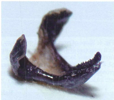
Fig. 5: Shape of titilator of specimens from Ljubljansko Barje, from various views.

Sl. 5: Oblika titilatorja pri primerkih z Ljubljanskega barja, iz različnih zornih kotov.