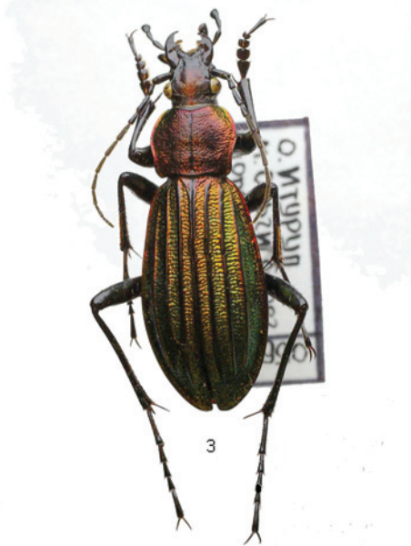
Fig. 3: Carabus kolbei chishimanus (Iturup Isl.)