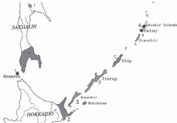
Fig. 7: Map of Hokkaido, South Sakhalin and the Kuril Archipelago: distribution of C. (Ainocarabus) avinovi (1); C. (Ainocarabus) kolbei aino (2); C. (Ainocarabus) kolbei chishimanus (3); C. (Ainocarabus) kolbei ushishirensis (4) and C. (Ainocarabus) kolbei urupiensis (5).