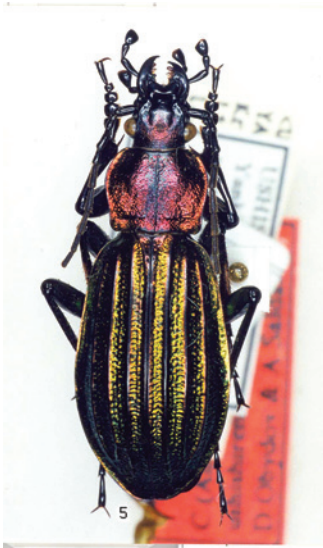
Fig. 5: Carabus kolbei ushishirensis (Ushishir Islands, Yankicha) (Holotype).