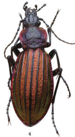
Fig. 4: Carabus kolbei urupiensis ssp. n. (Urup Isl.) (Holotype).