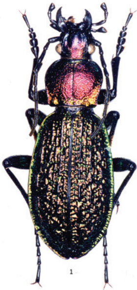
Fig. 1: Carabus avinovi (South Sakhalin)