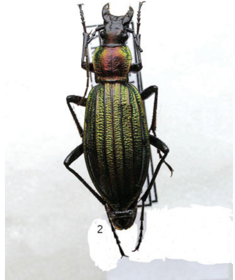
Fig. 2: Carabus kolbei aino (Kunashir Isl.)