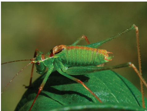
Fig. 3: Adult male of L. punctatissima , lateral view, from the locality Gornje Vreme near Divača.

Sl. 3: Odrasli samček L. punctatissima , stranski pogled, z lokalitete Gornje Vreme pri Divači.