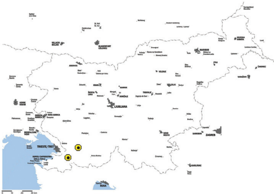
Fig. 1: Localities of L. punctatissima in Slovenia.

SI. 1: Karta Slovenije z označenima najdiščema vrste L. punctatissima .