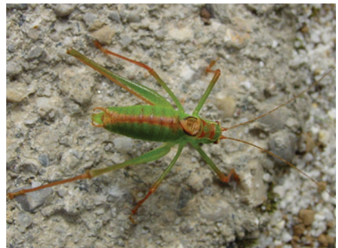
Fig. 4: Same as fig 3, dorsal view.

Sl. 3: Odrasli samček L. punctatissima , stranski pogled, z lokalitete Gornje Vreme pri Divači.