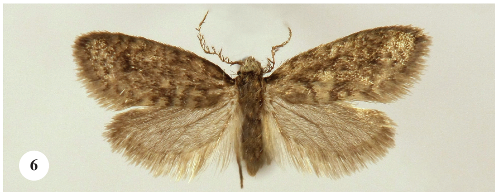
Figs. 3-6: Luffia lapidella : 3 - Bag of almost full-grown larva; 4 - Female laying eggs inside the larval case; 5 - Young larvae on the mother larval case; 6 - Male, Slovenia, Primorska, Socerb, 360 m, M. Lasan leg.

Relief Slovenije