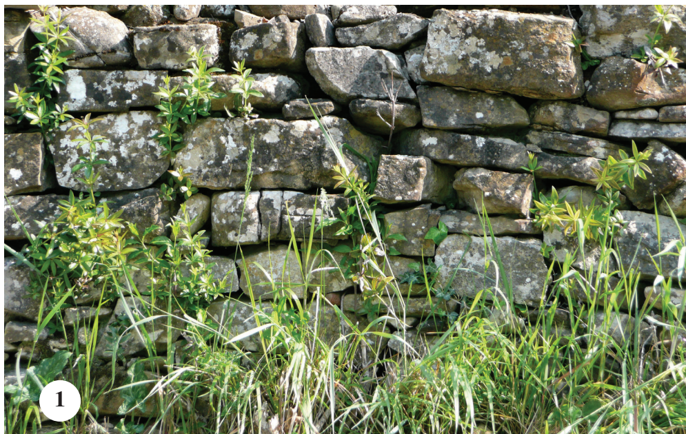
Fig. 1: Habitat in the village Padna on 25 th of April 2010: retaining wall of flysch sandstone. Small plants are lightly shadowing rocks, overgrown with lichens.