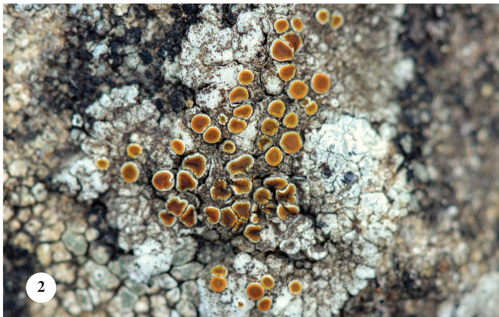
Fig. 2: Stone lichen - Lecanora dispersa .