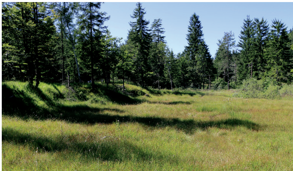
Fig. 4: Type locality of L. carniolicus sp. n.

In Slovenia, only L. striola has been recorded so far and has been revealed as rather rare and scattered throughout (SELJAK, 2004; SELJAK, 2016). During entomological trips in summer 2016 another Limotettix species was discovered in a montane intermediate bog near the village Vojsko, which differs from all species described so far by a very characteristic shape of its aedeagus. It is described here as a new species.