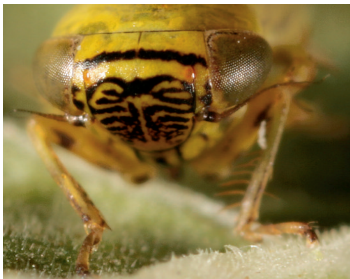
Fig. 3: Limotettix carniolicus sp. n. - head of a male

occur very scattered over the vast area of Russia and adjacent countries. Outside of Russia, four species have been recorded in Europe. Only L. striola (Fallén 1806) is widely distributed across Europe, while L. atricapillus (Boheman 1845), L. ochrifrons Vilbaste 1973 and L. sphagneticus Emeljanov 1966 are confined to the north-eastern Europe (OSSIANNILSSON, 1983; NAST, 1987). All these species inhabit permanent moist peatland, raised bogs and fens and are associated with various Cyperaceae, mostly Eleocharis spp. (HAMILTON, 1994; NICKEL, 2003).