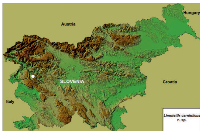
Fig. 8: Limotettix carniolicus sp. n. - type locality

posterior view, but without apical teeth; gonopore is in a small depression, which is placed towards the apical third; basal phragma sclerotized, broadly cordate in dorsal view, free articulated with the phalobase.