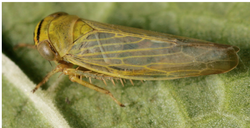
Fig. 1: Limotettix carniolicus sp. n. - male

This genus comprises currently about 35 described species that are allocated in three subgenera: subgenus Limotettix - 28 species, Neodrylix - 5 species and Dryola - 2 species (ZAHNISER, 2007). All Palaearctic species (16 in number) belong to the subgenus Limotettix s. str., while the subgenera Neodrylix and Dryola are entirely Nearctic (EMELJANOV, 1966; HAMILTON, 1994). The majority of the Palaearctic species