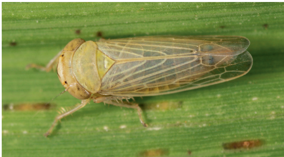
Fig. 2: Limotettix carniolicus sp. n. - female

occur very scattered over the vast area of Russia and adjacent countries. Outside of Russia, four species have been recorded in Europe. Only L. striola (Fallén 1806) is widely distributed across Europe, while L. atricapillus (Boheman 1845), L. ochrifrons Vilbaste 1973 and L. sphagneticus Emeljanov 1966 are confined to the north-eastern Europe (OSSIANNILSSON, 1983; NAST, 1987). All these species inhabit permanent moist peatland, raised bogs and fens and are associated with various Cyperaceae, mostly Eleocharis spp. (HAMILTON, 1994; NICKEL, 2003).