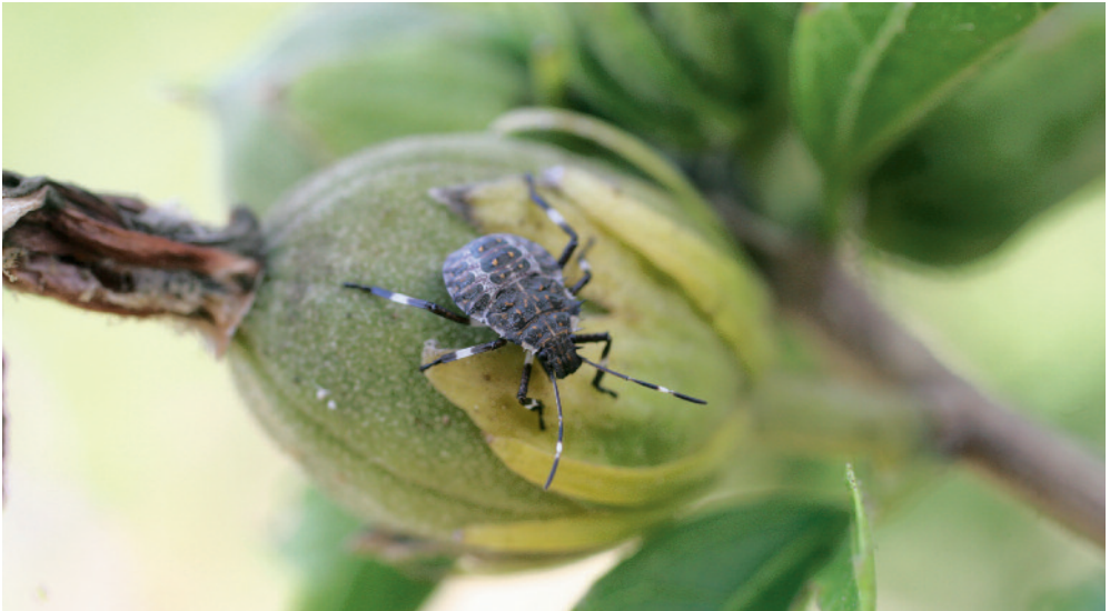
Fig. 2: H. halys nymph on Hibiscus syriacus , Šempeter pri Novi Gorici, 2017