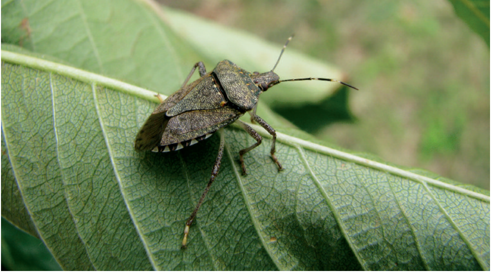
Fig. 1: H. halys , Kromberk, 2017

found on other five localities in the area around Nova Gorica. In July it was caught on pheromone trap placed in soya been in Bilje. In August it was detected by visual observation of olive tree in Podmark. At the same time in August it was caught on pheromone traps in Miren and Kromberk. In the middle of September, it was detected in urban area in the commercial building in Kromberk. Only single specimens of H.