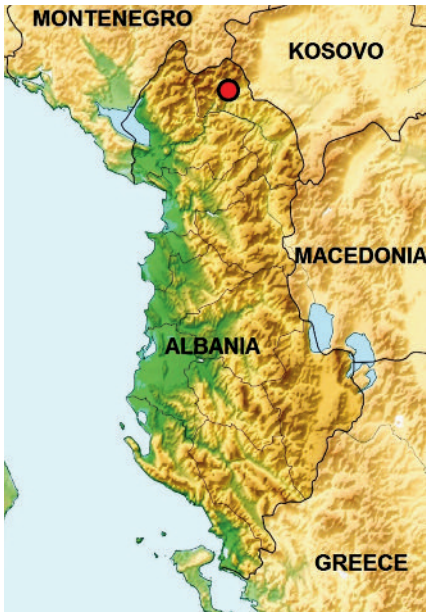
Fig. 1: Sampling site in Sylbicë village in Bjeshkët e Nemuna in Albania.