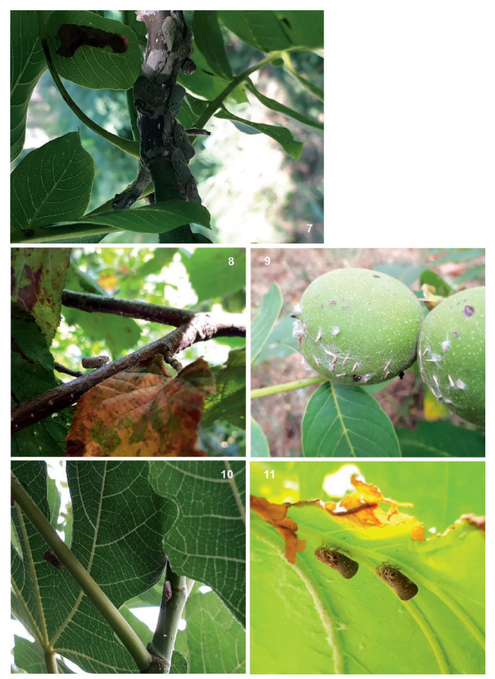
Fig. 7 - 11: Metcalfa pruinosa on various host plants in walnut and hazelnut gardens. 7. on Junglans regia , 8. Corylus avellana , 9. M. pruinosa secretions on walnut fruit, 10. on Ficus carica , 11. on leaf of plane.