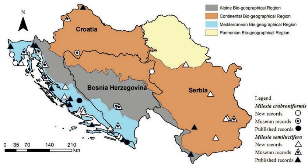
Fig. 2. Distribution of two species of the genus Milesia in Croatia, Bosnia, and Herzegovina, and Serbia with Biogeographical regions.

Although new data are presented in this paper, both Milesia species are still registered only from a small number of localities in all three countries. M. semiluctifera was registered at more localities than M. crabroniformis , but always with a smaller number of individuals. M. crabroniformis was during this survey registered at four new localities, one in Serbia and B&H and two in Croatia (Fig. 2). However, only records from Croatia and Serbia are recent, while the latter represent the first records for the country. Both species co-occur only at two localities, one in Croatia (city of Pula) and one in B&H (Jablanica).