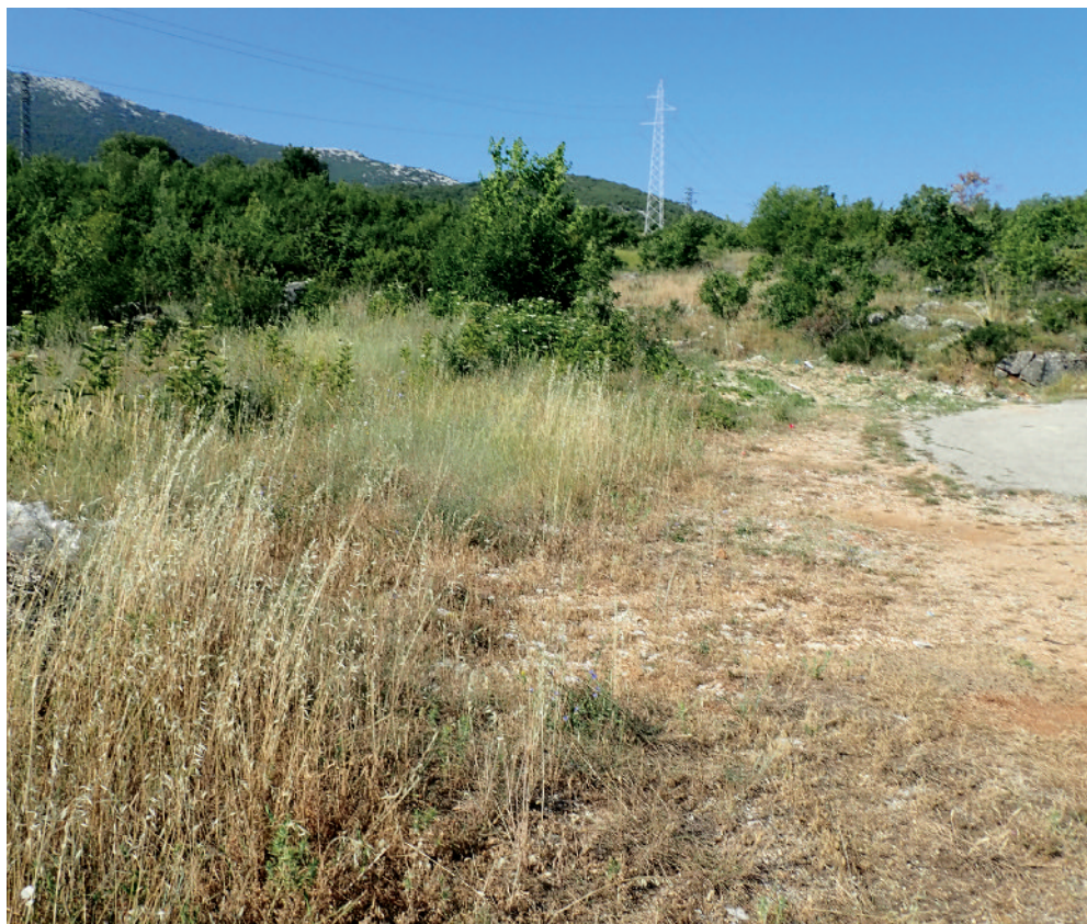
Fig. 3. Habitat of Milesia semiluctifera at Dugopolje, Croatia. The species was observed feeding on Sambucus ebulus flowers.

Slika 3. Habitat vrste Milesia semiluctifera v Dugopolju na Hrvaškem. Vrsta je bila opažena, kako se hrani na cvetovih Sambucus ebulus .