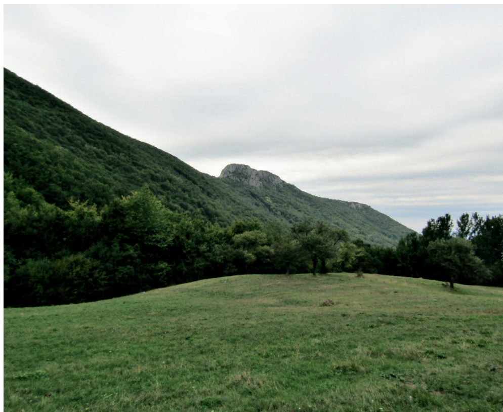
Fig. 4. Habitat of Milesia semiluctifera at Gornja Studena, Suva planina Mt., Serbia. The species was observed feeding on Convolvulus arvensis flowers.

Given that both Milesia species are saproxylic, conservation of forest habitats and especially old, living trees are very important for their long-term survival.