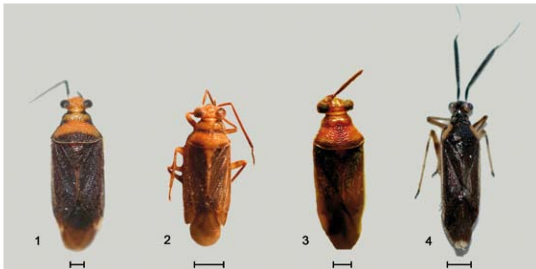
Habitus of Adpiasmus -species in dorsal view. – fig.1. Adpiasmus punctatus CARVALHO & SCHAFFNER, 1973, female holotype (USNM). – fig. 2. Adpiasmus mayanus CARVALHO & SCHAFFNER, 1973, a male specimen from Salvador, identified by CARVALHO (ISNB). – fig. 3. Adpiasmus ecuadorianus CARVALHO & CARPINTERO, 1986, male holotype (MACN). – fig. 4. Adpiasmus riegeri n. sp., female holotype (MNHN). Scales = 1 mm.

FRITZ leg. (MACN) [approximate coordinates according to Google Earth: 01°02'S, 79°27'W].