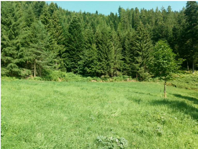
Fig. 2: Example of a small game meadow in the Black Forest National Park.

One of the small nutrient-poor meadows with