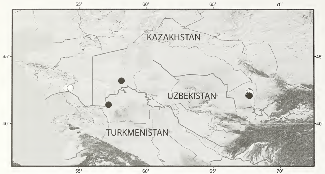
Fig. 6: Collection localities of Oculicosa supermirabilis Zyuzin, 1993. Closed dots – original data), open dots – literature-derived data.

kent, Shymkent] Area, Otrar Distr., Kyzylkum Desert, N foothills of Karaktau [=Kairaktau] Hills, c. 43.8 km NW of Bairkum, nr. Tabakbulak (42°21'26.7"N, 67°41'56.3"E), clayey soil, c. 225 m. a.s.l., 23-25.05.1993, A. A. Zyuzin leg. – (3) Kazakhstan, South Kazakhstan [=Chimkent, Shymkent] Area, Arys' Distr., Kyzylkum Desert, c. 35.2 km NW of Bairkum, Karaktau [=Kairaktau] Hills, Karamola Mt., top part (42°16'48.4"N, 67°45'28.7"E), c. 376 m. a.s.l., 29-31.05.1993, A. A. Zyuzin leg.