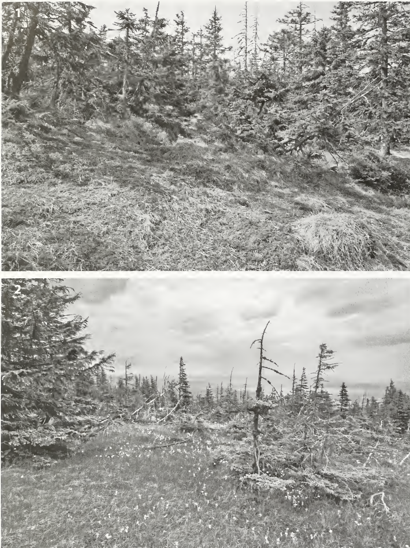
Figs 1-2: Mire where Maro lehtineni was recorded

od for these records: 27 April–12 May 2011, 12–30 May 2011, 16 June–3 July 2011, 10–29 May 2012). This species cohabited with M. lepidus (21 males, 4 females) and M. sublestus (1 male) in the same mire.