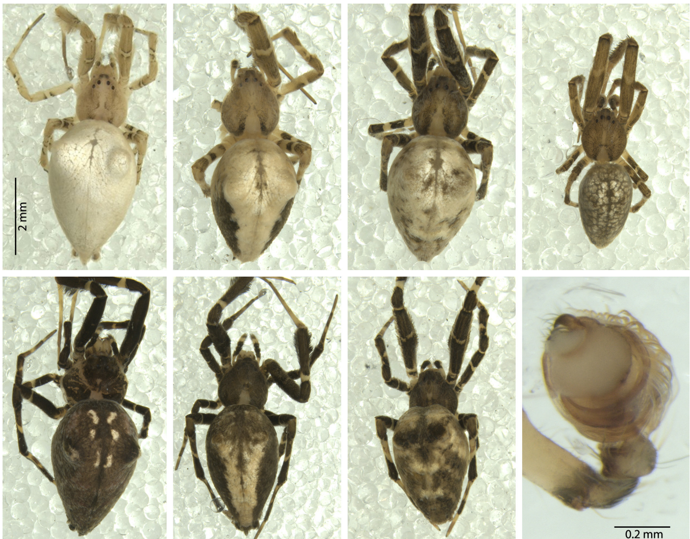
Fig. 2: Uloborus plumipes – colour patterns of females on the left, male on the top right and male palp on the bottom right

The investigated localities were selected according to their potential for introduction of non-native spider species. The number of localities within the different categories varies. Even if no quantitative comparisons were intended some tendencies are obvious. So we can state, that in category I (greenhouses, garden centres, flower shops and flower wholesale stores) and IV (botanical gardens and zoos) the highest densities of spider individuals as well as the highest number of non-native spider species were observed. One explanation for the higher density in greenhouses of nurseries and in the zoological gardens could be the size of the localities and the higher diversity of habitats within the localities. It is clear that in a flower shop of 20 m 2 with daily cleaning there are not the