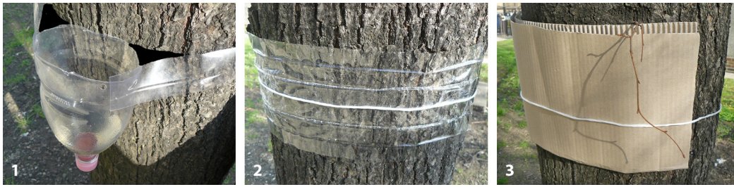
Fig. 1: Pitfall trap made from a plastic bottle