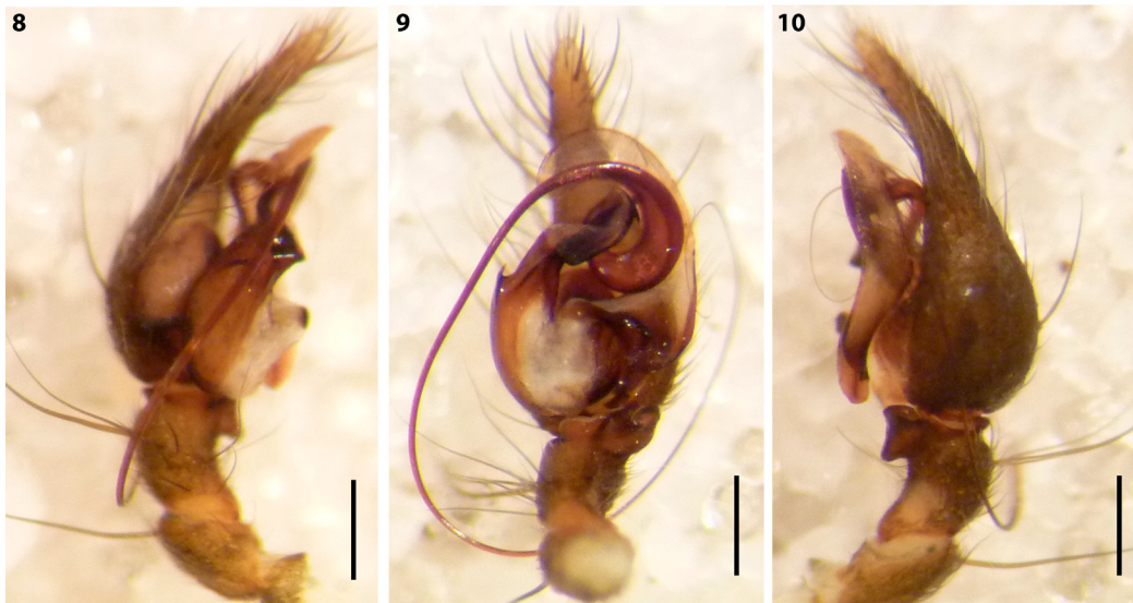
Figs 8–10: Histopona vignai Brignoli, 1980, male palp, prolateral, ventral and retrolateral views, scales: 0.3 mm

Male palps (holotype) (Figs 5–7, 13–15). Tibia with two retrolateral apophyses. RTA, consisting of two rectangular sclerites, the outer partially covering the inner, situated distally-retrolaterally on the tibia. Retrolaterally-basally, a further