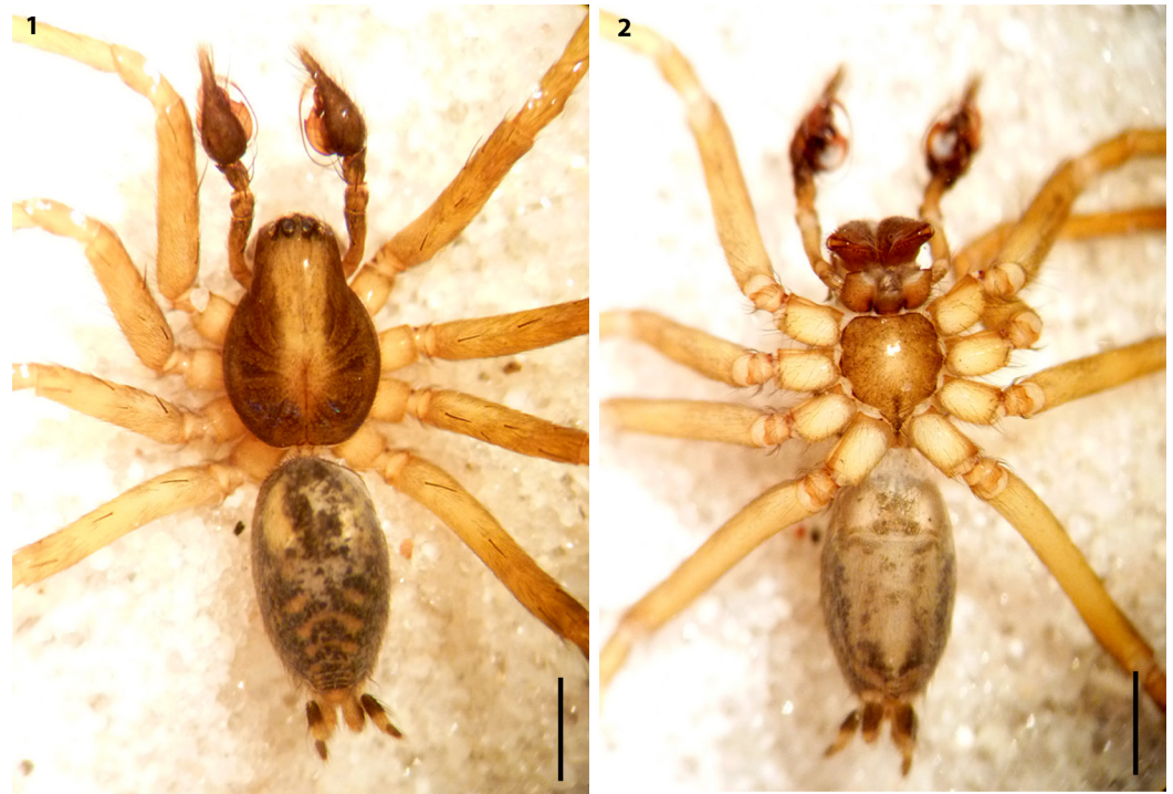
Figs 1–2: Histopona kurkai sp. n., male holotype, habitus, dorsal and ventral views, scales: 1.7 mm