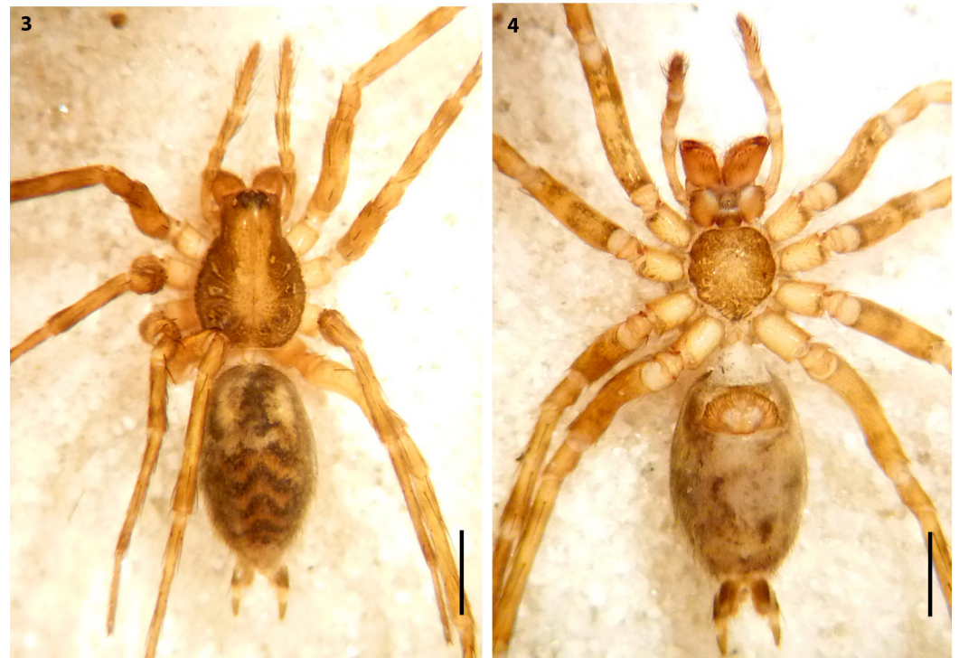
Figs 3–4: Histopona kurkai sp. n., female paratype, habitus, dorsal and ventral views, scales: 1.6 mm

a convex margin, being distinctly smaller than the outer, and the base of the whole distal RTA-complex protrudes significantly ventrally (Figs 9–10). The female epigyne also resembles that of H. vignai (based on Brignoli's drawings) but has a greater distance between the copulatory duct coils (Figs 11–12, 16–17).