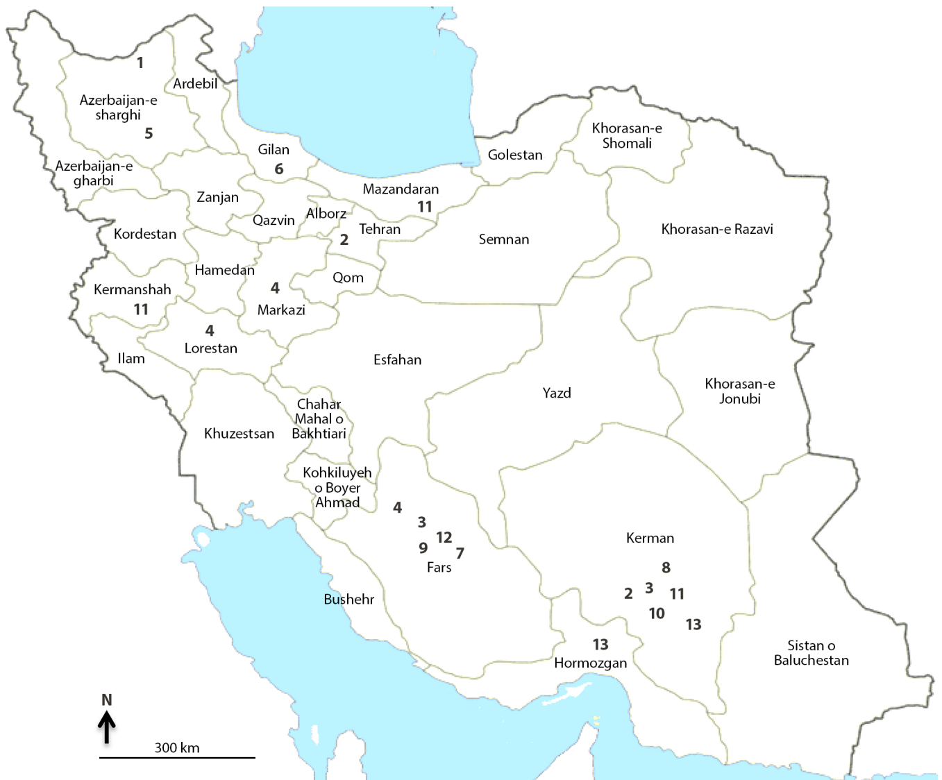
Fig. 1: Distribution of the Cheliferidae Risso, 1827 species reported from Iran (according to Iranian provinces): (1) Beierochelifer peloponnesiacus (Beier, 1929); (2) Dactylochelifer brachialis Beier, 1952; (3) Dactylochelifer gracilis Beier, 1951; (4) Dactylochelifer intermedius Redikorzev, 1949; (5) Dactylochelifer kussariensis (Daday, 1889); (6) Dactylochelifer latreillii (Leach, 1817); (7) Dactylochelifer mrciaki Krumpál, 1984; (8) Dactylochelifer spasskyi Redikorzev, 1949; (9) Ellingsenius fulleri (Hewitt & Godfrey, 1929); (10) Gobichelifer chelanops (Redikorzev, 1922); (11) Hysterochelifer afghanicus Beier, 1966; (12) Rhacochelifer melanopygus (Redikorzev, 1949); (13) Strobilochelifer spinipalpis (Redikorzev, 1918) (Beier 1951, 1971, Mahnert 1974, Schawaller 1983, Judson 1990, Nassirkhani & Takaloo zade 2012, 2013a, 2013b, Nassirkhani & Shoushtari 2014, 2015, Nassirkhani et al. 2016, present study)