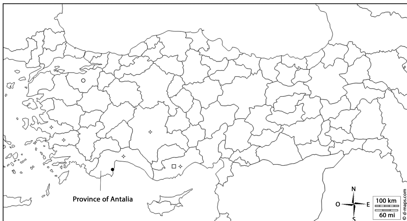
Fig. 4: Geographical location of Philodromus musteri spec. nov., locus typicus (●) and location by province of three other species of the Philodromus aureolus group: P. bonneti (○), P. buchari (□), P. lunatus (◇), based on Demir (2008) and Logunov & Kunt (2010)

Philodromus bonneti Karol, 1968 is a reportedly endemic species known so far only from northwest Turkey (Bursa) and only from the male. It was described by Karol (1968) as belonging to the Philodromus aureolus group and recognized as such by Muster & Thaler (2004), but could not be traced at the Paris museum. The authors state that this species resembles P. lunatus with respect to characters of the male palpal organ. However, several details actually suggest that some structures have been schematized in the figures, i.e. simple, conical shape of several apophyses (RTA, ITA), unfigured descending part of sperm duct loop, schematic conductor contour and the unfigured intertegular reticulum, at least in retrolateral view.