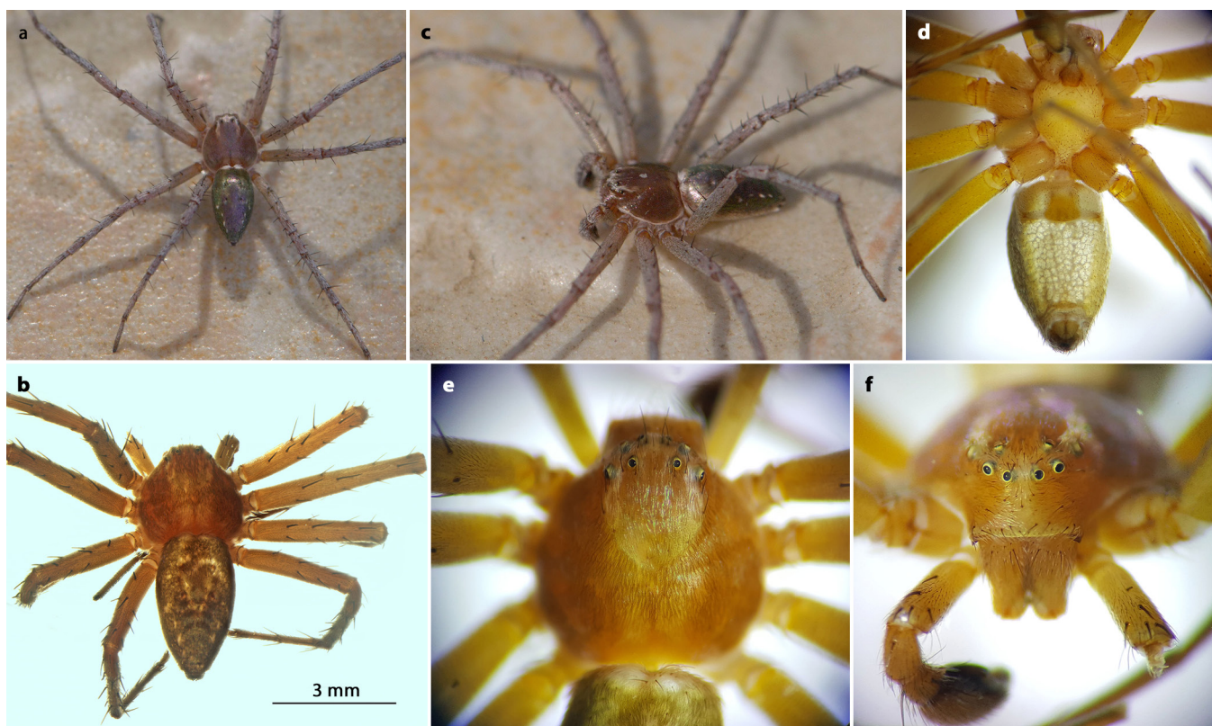
Fig. 1: Philodromus musteri spec. nov. male holotype. a-b. dorsal view; c. lateral view; d. ventral view; e. prosoma, dorsal view; f. prosoma, dorso-frontal view ( a, c: living specimen; b, d-f: ethanol preserved specimen)

view (Figs 2c, 3b); RTA robust, pointing outwards, distally truncated (Figs 2, 3d), the ventral (black arrow, Fig. 2a) and dorsal (white arrow, Fig. 2g) borders straight. Cymbium asymmetrical, markedly widened prolaterally; cymbial process moderately protruding as a transparent, rounded lamella. Tegulum, subcircular, prolateral side with projection, visible in ventro-prolateral view (white arrow, Fig. 2e); retrolateral tegular projection barely developed; intertegular retinaculum discreet, visible in ventro-retrolateral view (Fig. 2d). Descending part of sperm duct loop pointing to retrolateral corner of cymbium (white arrow, Fig. 2a). Embolus, sickle-shaped, regularly curved, embolar base weakly thickened on its inner side, originating near mid-half of tegulum.