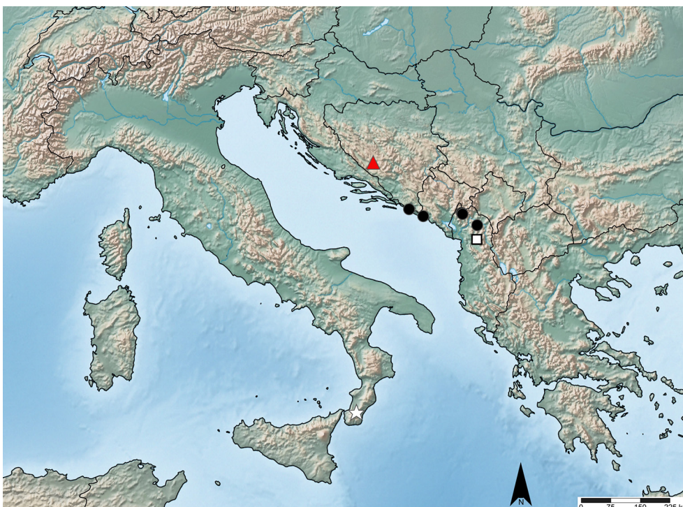
Fig. 4: Records of Xysticus brevidentatus on the Balkan Peninsula and in Italy. Red/grey triangle = new record from Bosnia and Herzegovina, black dots = records from Balkan Peninsula in the literature, white star = dubious record in Italy (Jantscher 2003). White square = record from “northern Albania” without exact location in Jantscher (2003), the symbol is set arbitrary.

Astrin et al. (2016) have shown that at least two species within the X. cristatus group ( X. cristatus (Clerck, 1757) and X. audax (Schrank, 1803)) are not separable on the basis of COI (barcode) sequences, which might be attributed to occasional hybridisation resulting in mitochondrial introgression between these very closely related species. Additional published barcode data in the BOLD database ( http://doi.org/10.5883/BOLD:AAP2437 ) show that the same COI haplotypes are also shared by X. gallicus Simon, 1875, X. slovacus Svatoň, Pekár & Pridavka, 2000 and X. macedonicus (e.g., X. macedonicus SPSLO281-12 from Switzerland identified by M. Kuntner, unpublished; X. gallicus GBMIN117776-17 from Greece and X. slovacus GBMIN117780-17 from Slovakia, reported in Gawryszewski et al. 2017: Suppl. Tab. 1). This indicates a considerable amount of genetic permeability of the species barriers in the X. cristatus species group.