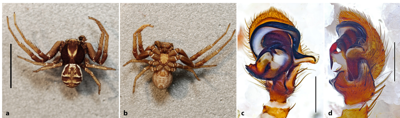
Fig. 2: Xysticus brevidentatus , male from Bosnia and Herzegovina. a. habitus dorsal view; b. habitus ventral view; c. pedipalp ventral view; d. pedipalp retrolateral view; scales: a, b = 5 mm, c, d = 0.5 mm

Based on the distribution reported in the literature, an occurrence of X. brevidentatus in Bosnia and Herzegovina was