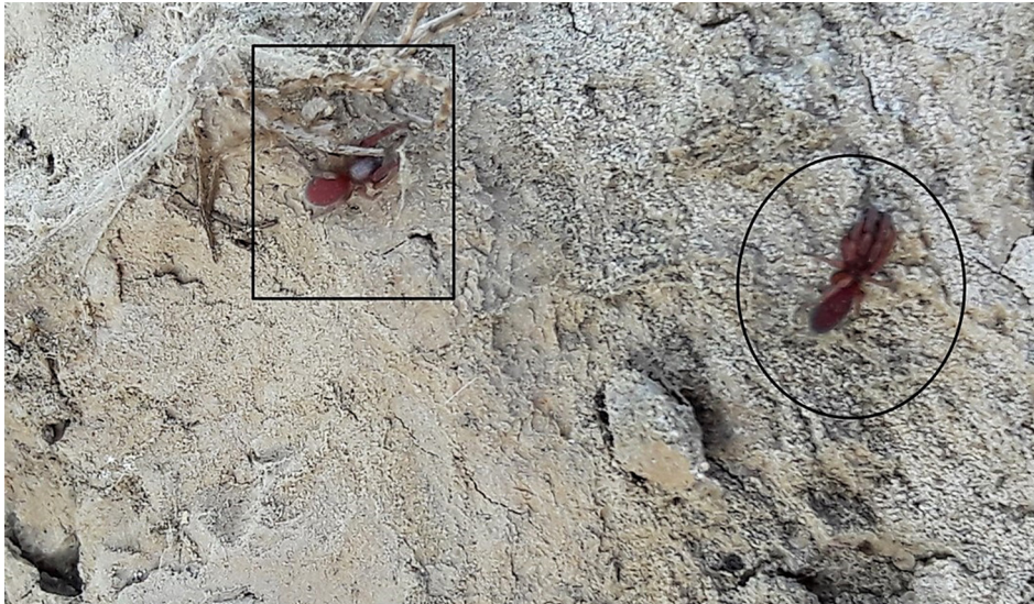
Fig. 4: Live specimens within the habitat: S. hobsoni (circle) and Palpimanus sp. (square)