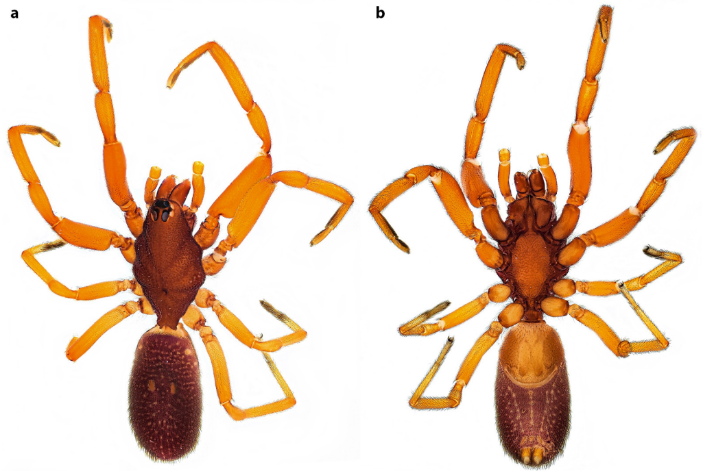
Fig. 1: Stenochilus hobsoni , male habitus, a. dorsal view, b. ventral view

mily) extends the range of the species 3000 km to the west (Fig. 3).