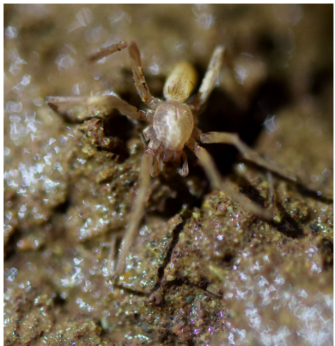
Fig. 1: Agraecina agadirensis , male (Morocco, Tizgui, Imi Ougoug, Ifri Ouado cave)

Agraecina agadirensis Lecigne et al. 2020: p.13, figs 1a, 4a–h, 5a–b (descr. female)