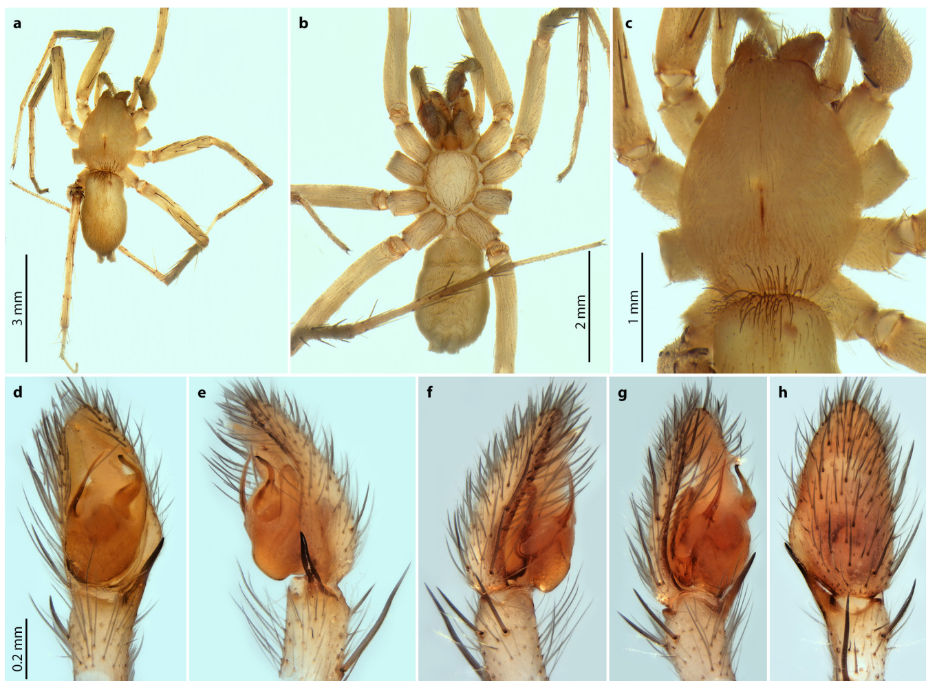
Fig. 2: Agraecina agadirensis , male. a. Dorsal view; b. Ventral view; c. Prosoma, dorsal view; d. Pedipalp, ventral view; e. Idem, retrolateral view; f. Idem, prolateral view; g. Idem, ventro-prolateral view; h. Idem, dorsal view

Material. 1 ♂, MOROCCO: region of Souss-Massa, prefecture of Agadir Ida-Outanane, caïdat of Taghazout, county of Aqsri, village of Tizgui, Ifri Ouado cave (Imi Ougoug) (30.61229°N, 9.46710°W, 770 m a.s.l.), on rocky soil with presence of pebbles (near a small stream), hand collecting, 22. Apr. 2021, leg. S. Moutaouakil (will be deposited at the Senckenberg Museum Frankfurt). Remark: left pedipalp and right leg II detached; left leg III missing.