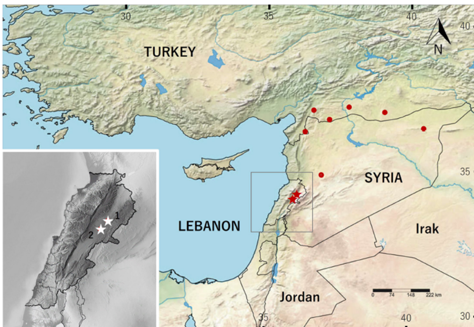
Fig. 2: Map showing collecting localities of Leiurus abdullahbayrami in Lebanon (stars in the main map and inset) and the current species' distribution (red dots), 1 – Maqneh, 2 – Brital

The trichobothrium db on the fixed finger of the pedipalp is located between trichobothria est and esb in the Lebanese specimens, as in the specimens from Turkey. On the other