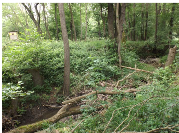
Fig. 2. Sampling site of Arion intermedius in the Lainzer Tiergarten.

Tiergarten, a Natura 2000 Area in the west of Vienna, which is also part of the Wienerwald Biosphere Reserve, a single specimen of A. intermedius was found. Another specimen could be recorded on the same place one year later. These are the first confirmed records of this species in Austria.