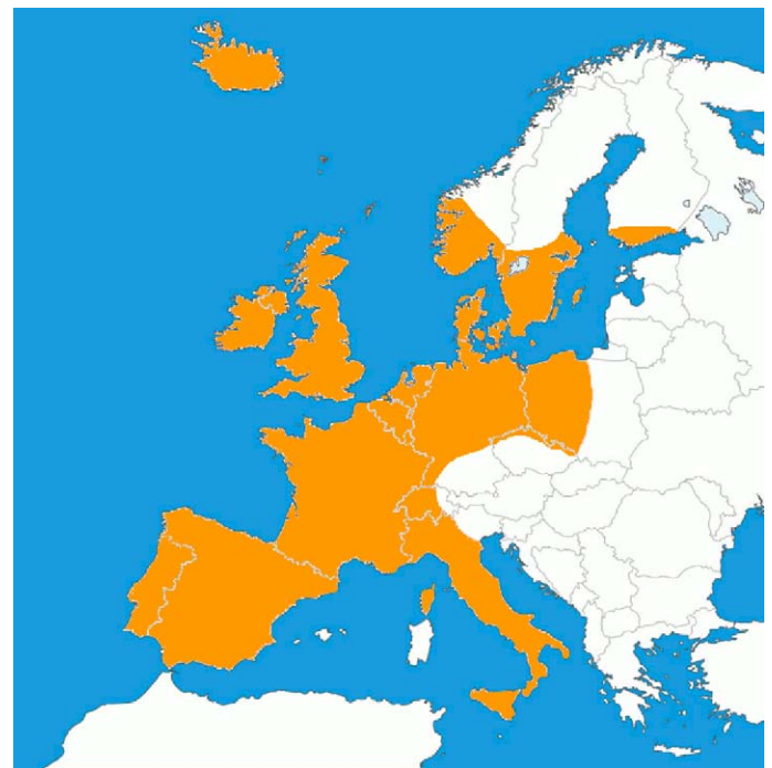
Fig. 1. Native distribution of Arion intermedius in Europe (according to Rowson 2017).

In Austria, A. intermedius was also mentioned in some species lists of Austrian molluscs (e.g. Klemm 1960, Reischütz 1974), but these records were later on found to represent A. obesoductus ( A. alpinus then) based on an intense investigations by Reischütz (1986).