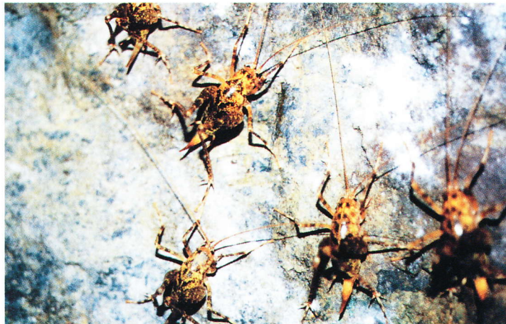
Fig. 2 Several females of Troglophilus cavicola observed on 28 January 1999

It means, that during the winter specimens prefer warmer places (central part of the passage), and during the vegetation season they migrate outside the passage. It is in accordance with the observations of OBENBERGER (1926) in Dalmatia.