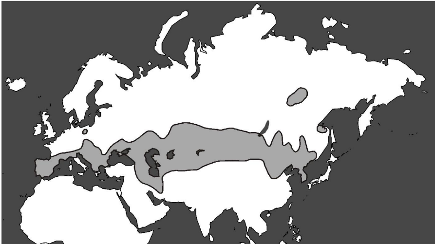
Fig. 1: Distribution of Arcyptera microptera (corrected map after SERGEEV 1986).

Arcyptera microptera exists typically on plan and collin grasslands (STEBAEV & MOLODTSOV 2001) of the steppe and forest-steppe areas (STOROZHENKO 1991), but it also occurs in high-mountainous regions (WILLEMSE 1984). Both larvae and imagos consume leaves of grass species (STOROZHENKO 1991). Phenologically Arcyptera microptera is a spring species, reaching adulthood earlier than most other grasshoppers of our region. The first instar larvae are present in April or mid-May. After 25-30 days, and 4 (TZYPLENKOV 1970) or 5 (BEREZHKO 1956) instars the specimen turn into imago and/or adult. Dying of the adults is significant already in mid-July (STOROZHENKO 1991).