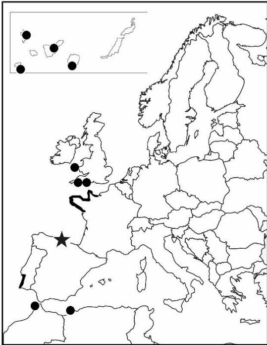
Fig. 3.: All localities where Pseudomogoplistes vicentae is known to occur. The Canary Islands are shown as an inset at the top left corner. The new site at Urbanización Gema del Mar is indicated with a star.