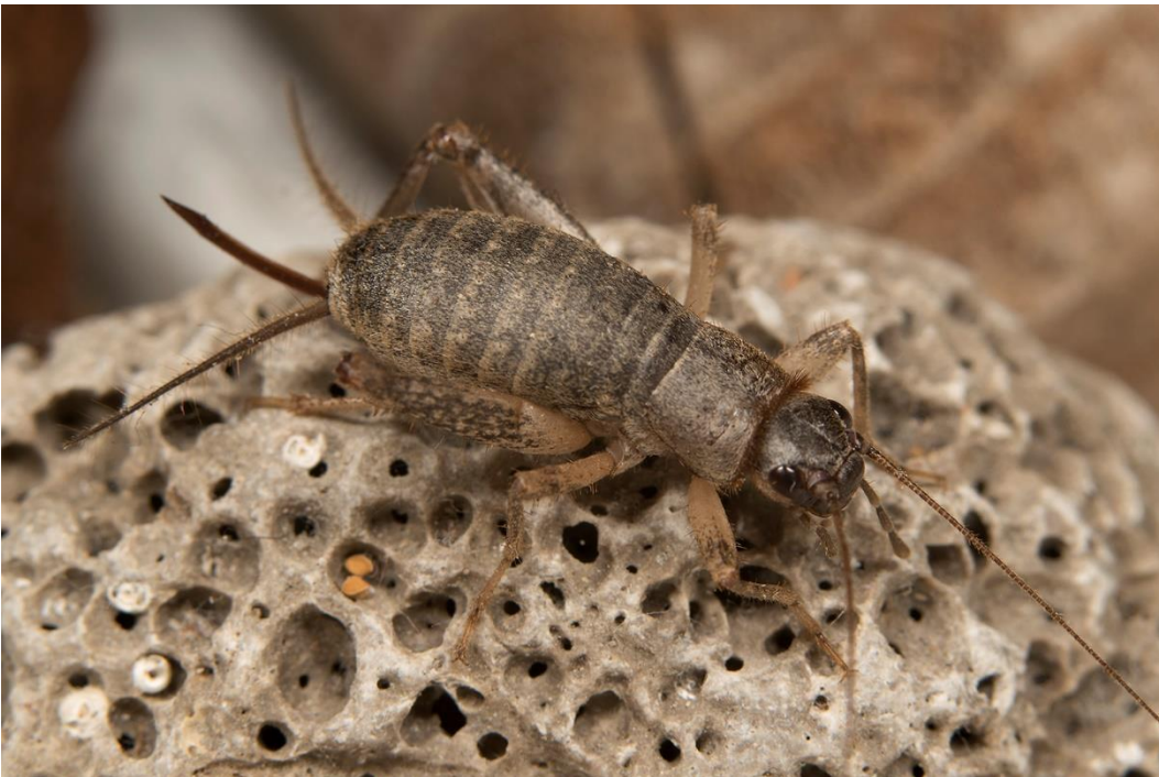
Fig. 2.: Pseudomogoplistes vicentae , female. Urbanización Gema del Mar.