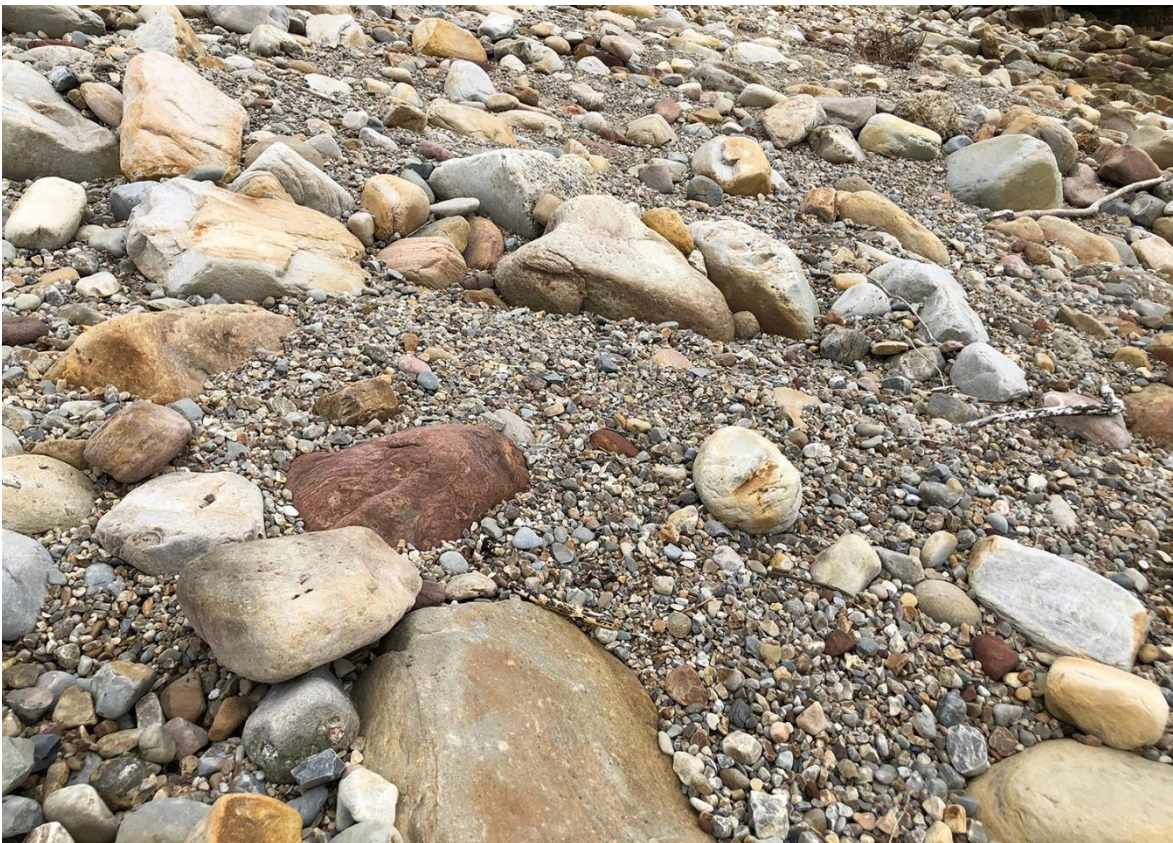
Fig. 5.: Habitat of Pseudomogoplistes vicentae at Urbanización Gema del Mar.