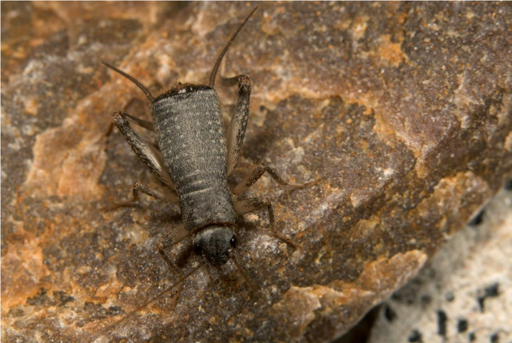
Fig. 1.: Pseudomogoplistes vicentae , male. Urbanización Gema del Mar.