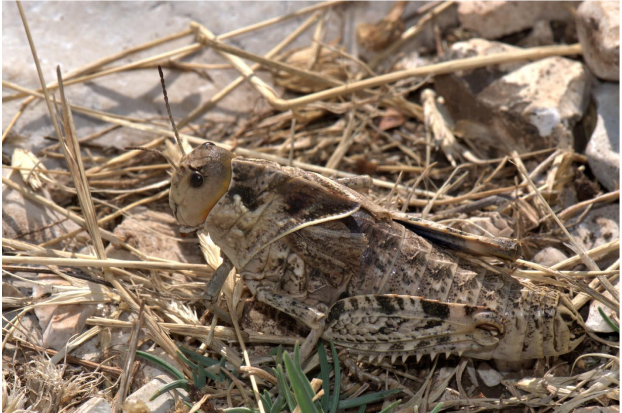
Fig. 1: Prionotropis willemsorum female, Nemërckë Mt – Albania

This new locality is about thirty kilometres from the northernmost station in Greece (Fig.2). The habitat consists of dry steppe grassland with some bushes of Juniperus sp. and Astragalus sp. (Fig.3). We find there also populations of grasshoppers linked to this habitat type, such as Peripodisma tymphii , Stenobothrus clavatus (Willemse, 1979), Stenobothrus fischeri (Eversmann, 1848), Celes variabilis (Pallas, 1771), Arcyptera microptera (Fischer von Waldheim, 1833). The relatively high elevation, 1450 m a.s.l., could explain this late occurrence in season, the species being generally seen in Greece up to July, but at lower altitudes (<1130 m a.s.l.). Due to the late time of the day of this finding, we did not spend more time searching for other individuals.