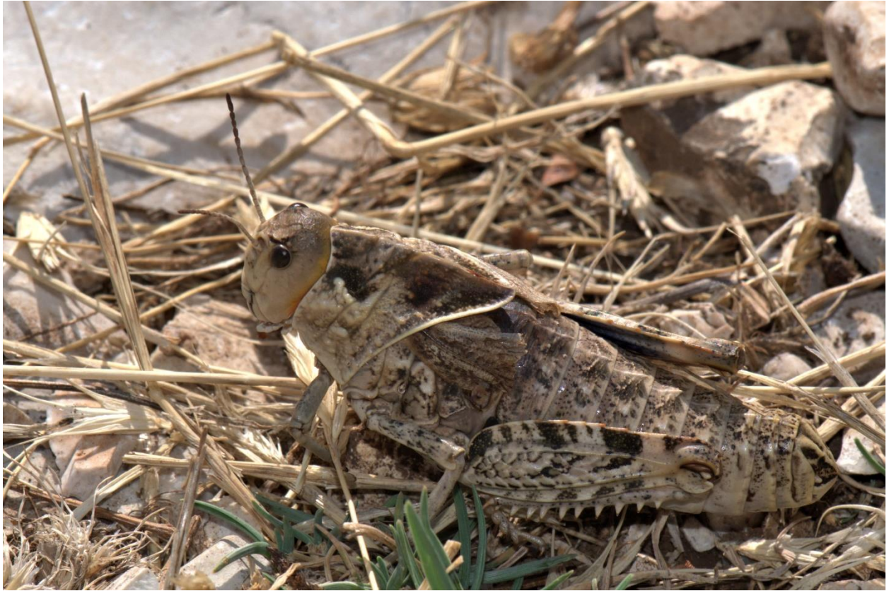
Fig. 1: Prionotropis willemsorum female, Nemërckë Mt – Albania

This new locality is about thirty kilometres from the northernmost station in Greece (Fig.2). The habitat consists of dry steppe grassland with some bushes of Juniperus sp. and Astragalus sp. (Fig.3). We find there also populations of grasshoppers linked to this habitat type, such as Peripodisma tymphii , Stenobothrus clavatus (Willems, 1979), Stenobothrus fischeri (Eversmann, 1848), Celes variabilis (Pallas, 1771), Arcyptera microptera (Fischer von Waldheim, 1833). The relatively high elevation, 1450 m a.s.l., could explain this late occurrence in season, the species being generally seen in Greece up to July, but at lower altitudes (<1130 m a.s.l.). Due to the late time of the day of this finding, we did not spend more time searching for other individuals.