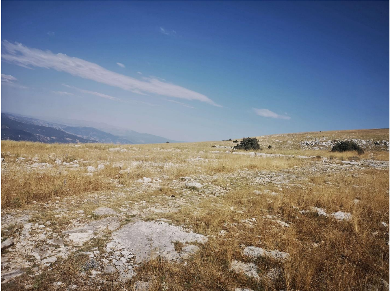
Fig. 3: Habitat of the new locality of Prionotropis willemsorum in Albania.