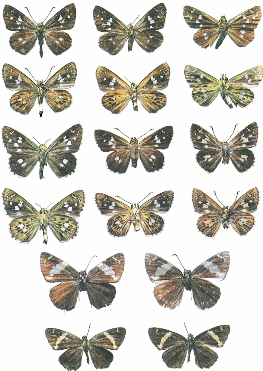
Colour plate IIIa/b