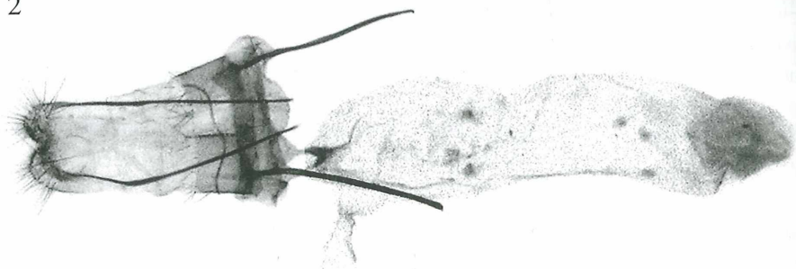
2. Genitalia of holotype of Stygia nilssoni spec. nov.