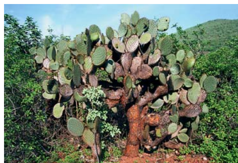
Pim van der Kraap, Bern

Brachycereus nesoticus (Cactaceae), Pionier auf nackter Lava, Genovesa.