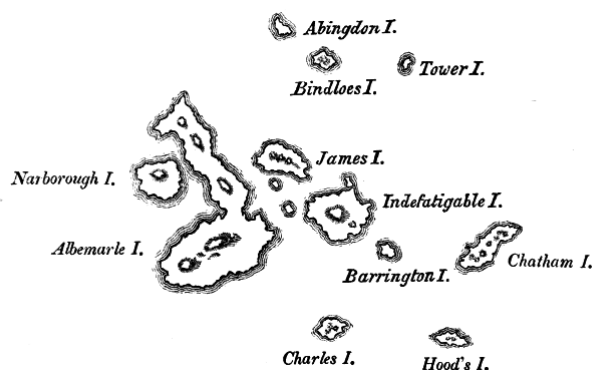
Fig. 2: Map of the Galápagos Islands (from Charles Darwin's "Journal of researches" 1845, p. 372).

Die Inseln des Galápagos-Archipels (Karte aus «Journal of researches» von Charles Darwin 1845, S. 372).