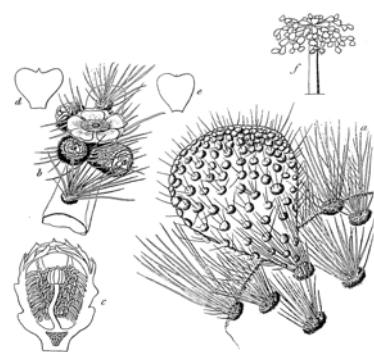
Fig. 14: Opuntia galapageia from the original description from HENSLOW (1837, p. 467). The sketch at the top right corner (f) is by Ch. Darwin.

Jasminocereus thouarsii (Cactaceae), Bestand des Säulenkaktus, Santiago.