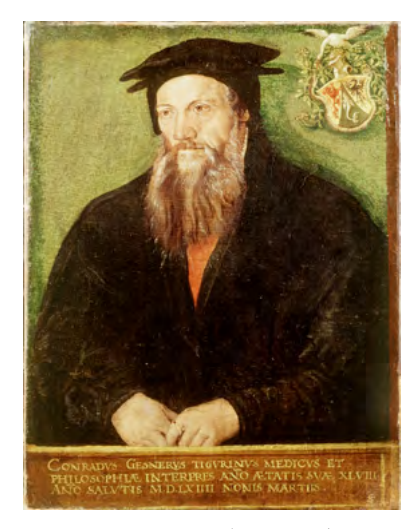
Fig. 4. Tobias Stimmer (1439–1584): Conrad Gessner, portrait of the scholar at the age of forty-eight (1564), oil and tempera on canvas, Museum zu Allerheiligen Schaffhausen.