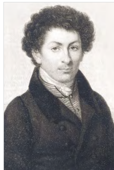
Fig. 1. Johann Conrad Laffon (1801–1882), collector of the first complete herbarium of the Canton of Schaffhausen, Switzerland