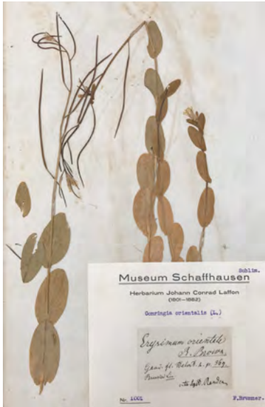
Fig. 3. Specimen of Conringia orientalis collected by J. C. Laffon between 1820–1847. This typical weed from agricultural and ruderal habitats is nowadays extinct in the Canton of Schaffhausen.