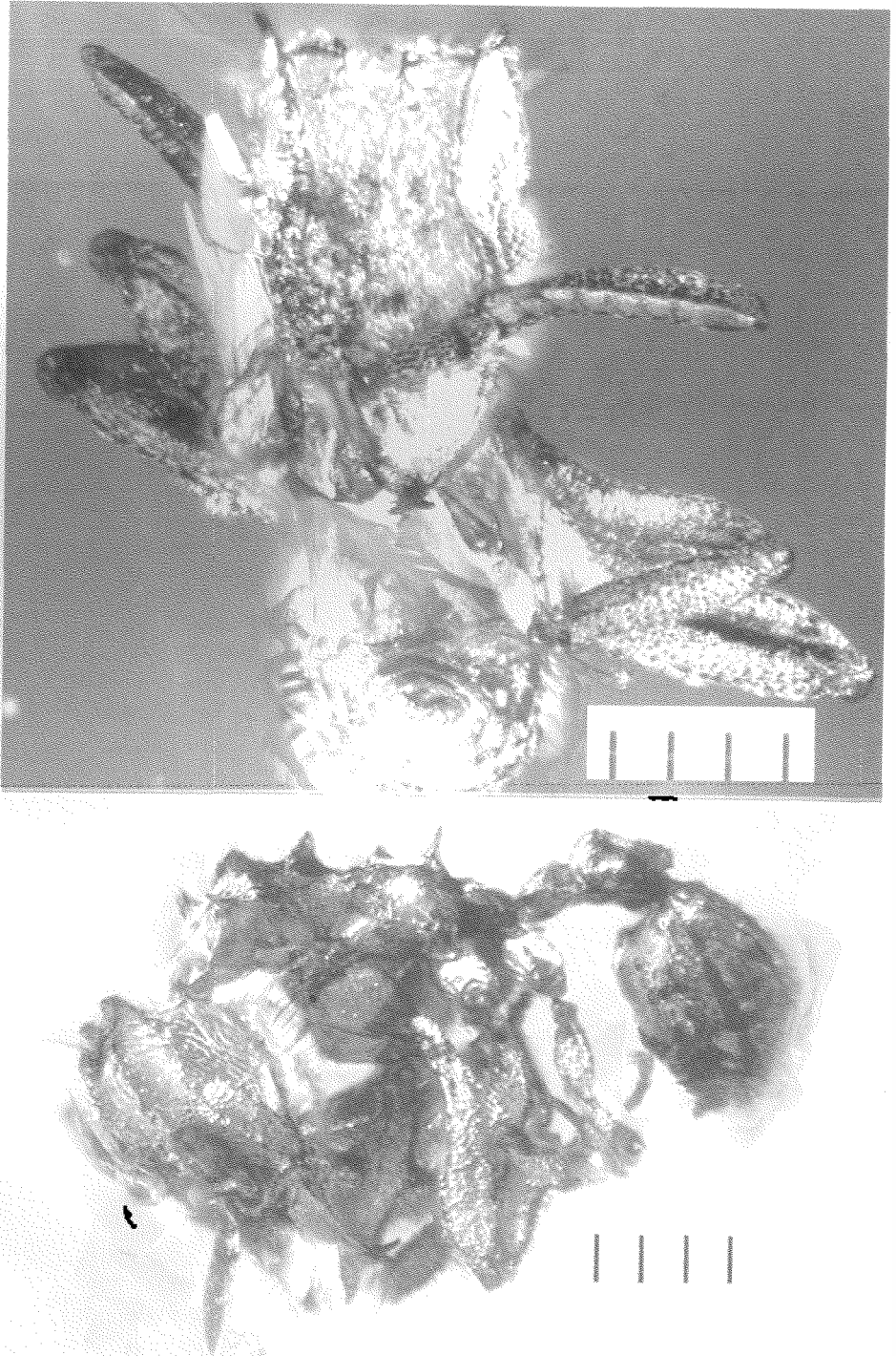
Fig. 1. Cyphomyrmex maya n. sp. worker. From Mexican amber: head in dorsal view (top), and profile of the whole specimen (bottom). Distance between two scale bars 0.1 mm.