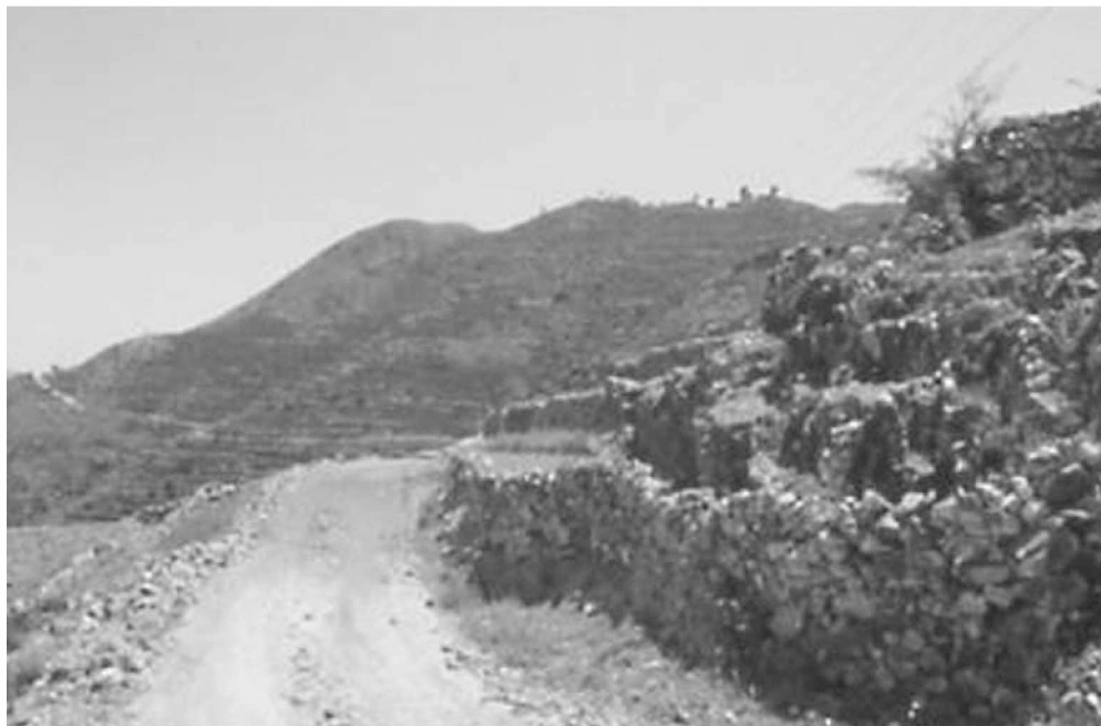
Fig. 3: A typical place to find Lasiommata felix near Bani Mawhab / Bait Muzaret. The artificial walls seem to be a suitable habitat for L. felix .

the English name wall brown in detail, we refrained to include the named locality in the list of records and distribution map.