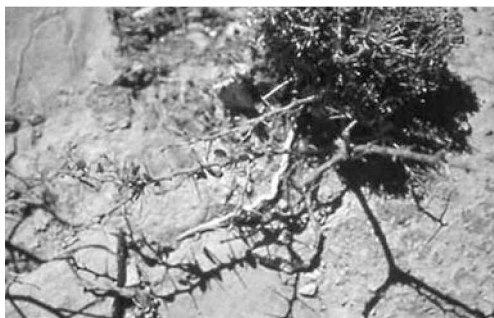
Fig. 2: Maytenus senegalensis ; showing a small-sized specimen which is mostly found due to over-grazing. Photo was taken from Ras Fartak.

Occasionally, where strong rocks are present and the locality is protected, Maytenus bushes can reach 4 m in height. At the beginning of the rainy season, Maytenus shrubs develop fresh shoots after the first rain. Since the first instar larvae are dependent on these soft-leaved fresh shoots, the flight activity of the imagines appears to be limited to the arid periods before the rainy seasons. The first generation is limited to March; the second generation lasts from end of June till mid of July. The third and last generation continues from end of September till early October. The flight period is strictly correlated with these seasons. This corresponds to observations on other Zygaeninae feeding on Celastraceae (e. g. Orna , Epiorna , Epizygaenella ).