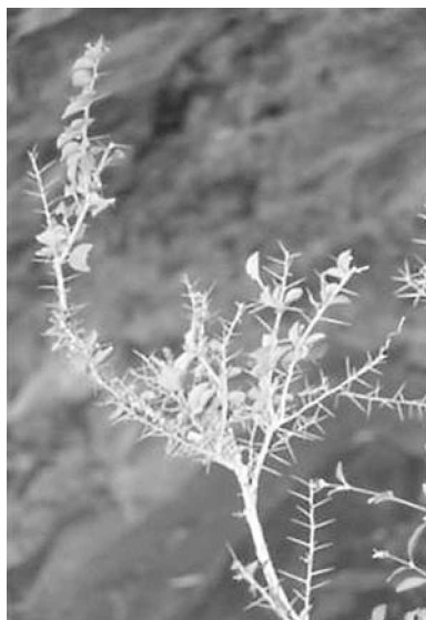
Fig. 1: Maytenus senegalensis ; the larval food plant of R. simonyi ; photo taken from Tur-Al-Baha, Jabal Araph.

The larvae of Reissita simonyi are limited to the food plants of the genus Maytenus (Celastraceae): M. senegalensis and M. dhofarensis . The larvae exclusively feed on leaves of these taxa (Fig. 1).