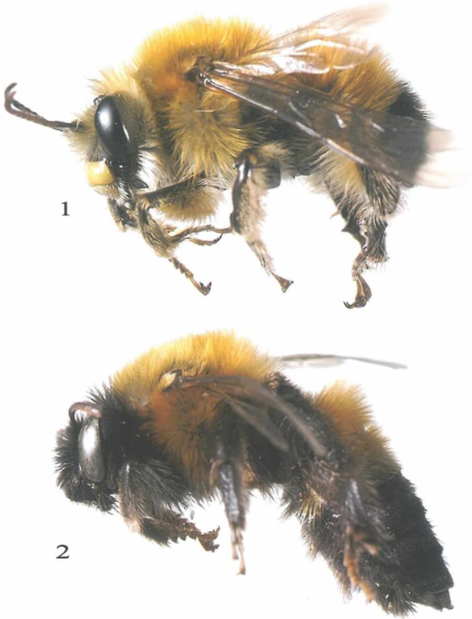
Figs 1-2: Cubitalia (Cubitalia) baal sp. n. – 1 lateral habitus of male holotype. – 2 lateral habitus of female paratype.

Integument of clypeus and labrum smooth; labrum with coarse punctures separated by a puncture width or less; clypeus with sparsely scattered, shallow, coarse punctures. Mandibular surfaces smooth. Integument of remainder of head strongly tessellate except faintly imbricate (nearly smooth) in small patches immediately anterior to and bordering median ocellus and along outer margins of lateral ocelli. Face with faint punctures