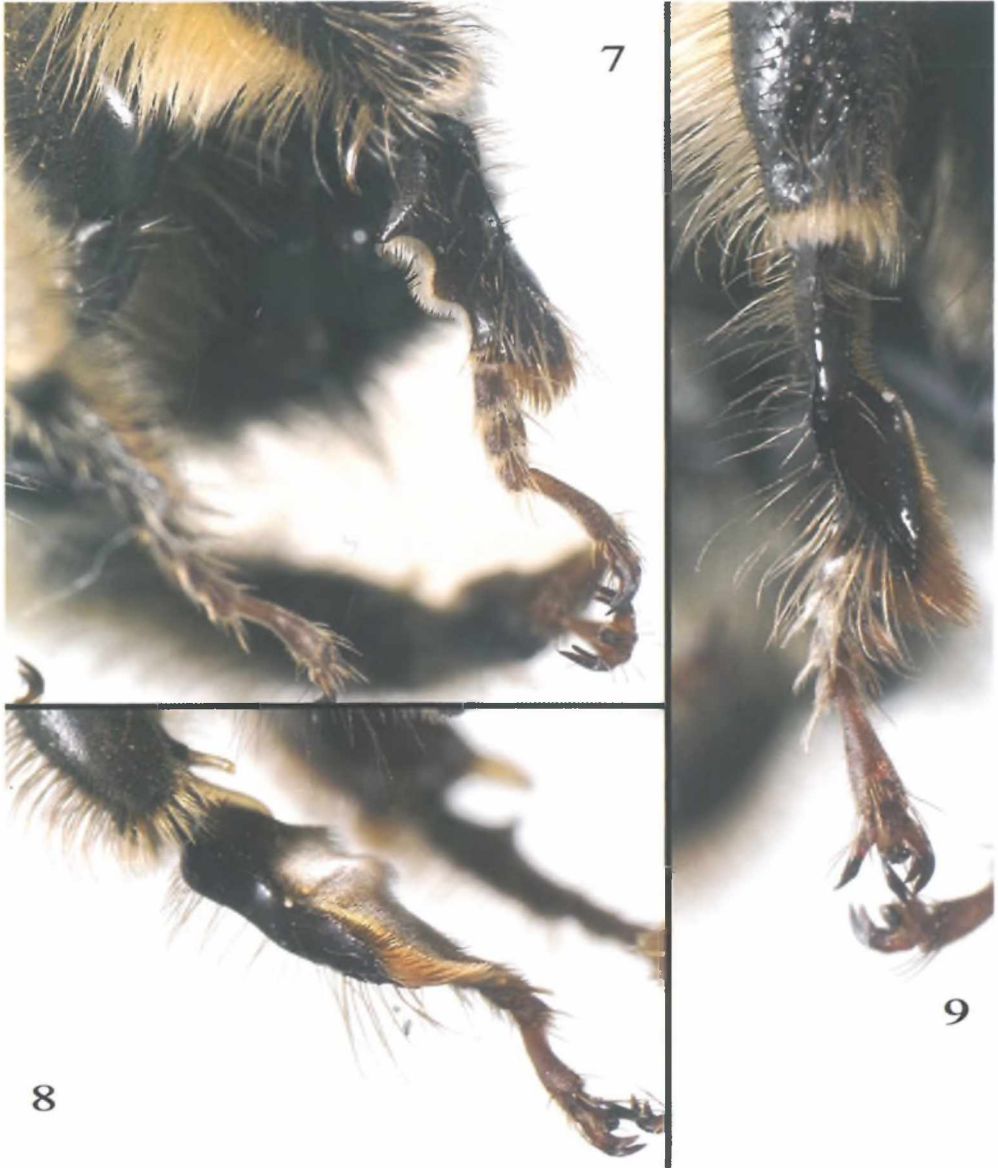
Figs 7-9: Cubitalia (Cubitalia) baal sp. n., male hind leg. – 7 anterior surface of metabasitarsus. – 8 oblique, inner-posterior surface of metabasitarsus. – 9 outer dorsal surface of metabasitarsus.

scattered, shallow, faint punctures; pleura with faint punctures separated by 1–3 times a puncture width. Metasomal terga imbricate and punctate, punctures shallow, small, and separated by 1–2 times a puncture width; metasomal sterna imbricate except smooth between lateral tufts on fifth metasomal sternum.