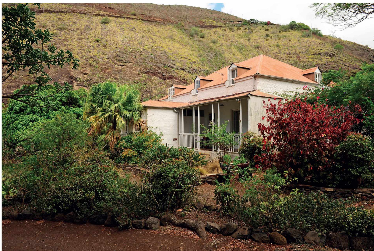
Fig. 7: Cambrian House and its surroundings, habitat of Agdistis cambriana spec. nov.

Genitalia ♂ (Fig. 2): uncus similar to that of A. marionae , but caudal margin concave incised, lateral tips divergent. Valvae symmetrical, basal parts dumpy, in distal half slender, strip-shaped; outer parts of valva bent, bar-shaped, broadened at the end, but not crenate as in