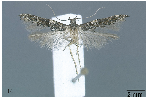
Figs 7-14: 7 - Epermenia (Calotropis) dallastai ; 8 - Epermenia (Calotropis) costomaculata ; 9, 10 - Epermenia (Calotropis) turicola ; 11 - Epermenia (Calotropis) hamata ; 12 - Epermenia (Calotropis) aarviki ; 13 - Epermenia (Calotropis) ruwenzorica ; 14 - Epermenia (Calotropis) tenuipennella .